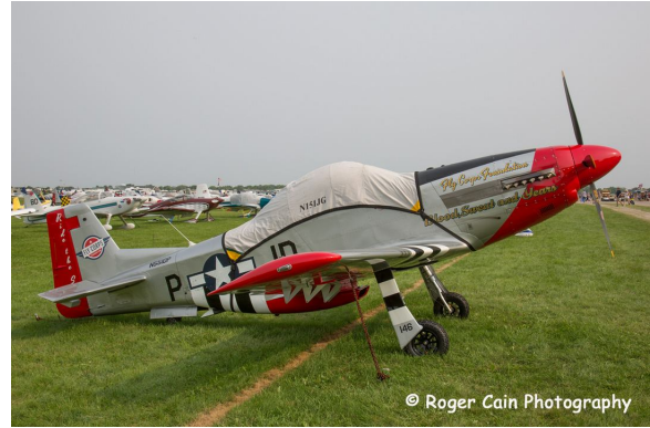
Titan Mustang Canopy Cover