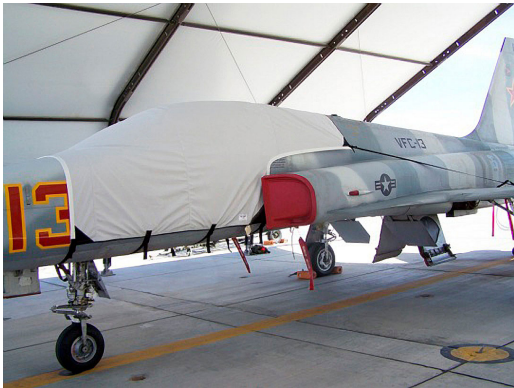
Northup F5 Talon Canopy Cover