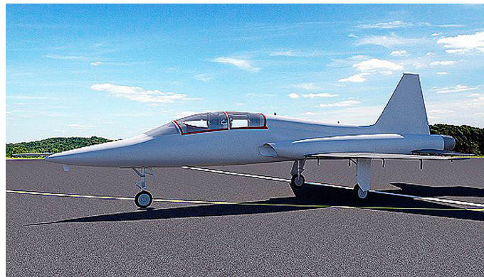
T-38 Talon Wing and Horizontal Stabilizer Covers (3D Rendering)