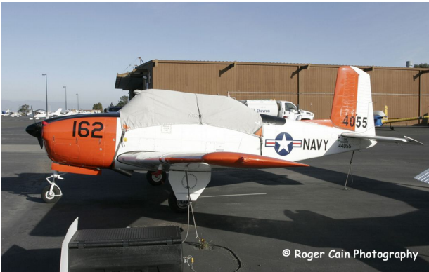
Beech T-34 Canopy Cover