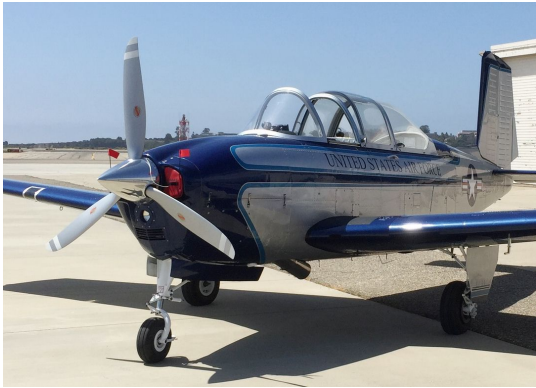
Beech T34 Engine Plugs