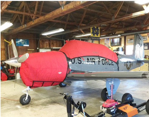
Beech T34 Mentor Canopy Cover, Insulated Engine Cover

This cover type is made from Silver Acrylic Sunbrella canvas and is 100% lined with a soft and smooth microfiber. Bruce's Custom Covers developed this material combination especially for aircraft protection. The outer material is medium weight and treated for water resistance, UV resistance and anti-static buildup. The inner lining is a very soft and smooth microfiber to prevent scratching. The material is very reflective, and tests show that the cabin interior temperature can be reduced to near-ambient temperature on the hottest of days. It is water, ice and snow repellent, yet breathable to allow moisture to escape from between the cover and the aircraft surface.