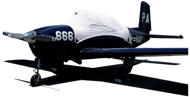
Beechcraft T-34B Mentor Canopy Cover, for 36% Scale Model