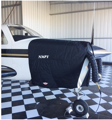
Beech Bonanza 36 Models Insulated Engine Cover

This cover type is made from Silver Acrylic Sunbrella canvas and is 100% lined with a soft and smooth microfiber. Bruce's Custom Covers developed this material combination especially for aircraft protection. The outer material is medium weight and treated for water resistance, UV resistance and anti-static buildup. The inner lining is a very soft and smooth microfiber to prevent scratching. The material is very reflective, and tests show that the cabin interior temperature can be reduced to near-ambient temperature on the hottest of days. It is water, ice and snow repellent, yet breathable to allow moisture to escape from between the cover and the aircraft surface.