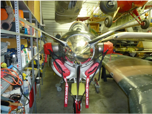
Beech T34C Engine Plugs, Prop Tie/Exhaust Plugs

of the plugs. Most plugs are imprinted with the aircraft registration number in black for an extra charge. Storage bag NOT included. Engine plugs may be inserted after flight when the engine is still warm. Engine Inlet Plugs are commonly referred to as Cowl Plugs, Intake Plugs, Cowl Blocks, Engine Blocks, and Engine Bungs.