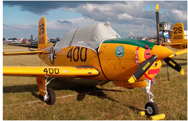
T34 Canopy Cover & Engine Inlet Plugs