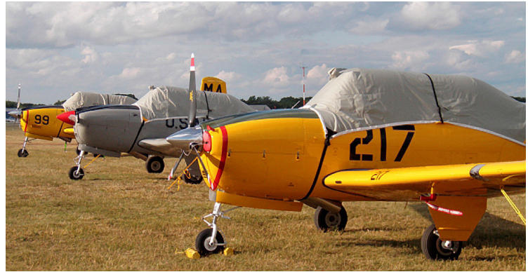
T34 Canopy Covers & Engine Inlet Plugs