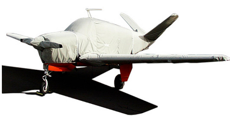
Beech Bonanza Full Cover Set

WINTER USE MATERIAL - Made with Solution-Dyed Polyester fabric, this option is intended for seasonal use to aid in deicing, rain mitigation, or for occasional travel. The material is lighter and more compact, but more susceptible to UV damage and may have a shorter useful life if used continuously outside than the all-year use material.