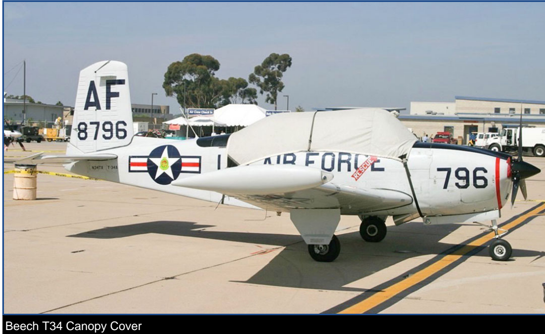
Beech T34 Canopy Cover