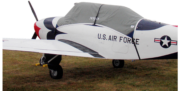
T34 Canopy Cover