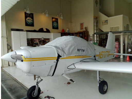
Thorp Sky Scooter T211 Canopy Cover

This cover type is made from Silver Acrylic Sunbrella canvas and is 100% lined with a soft and smooth microfiber. Bruce's Custom Covers developed this material combination especially for aircraft protection. The outer material is medium weight and treated for water resistance, UV resistance and anti-static buildup. The inner lining is a very soft and smooth microfiber to prevent scratching. The material is very reflective, and tests show that the cabin interior temperature can be reduced to near-ambient temperature on the hottest of days. It is water, ice and snow repellent, yet breathable to allow moisture to escape from between the cover and the aircraft surface.