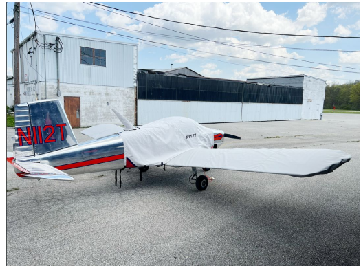
Thorp Sky Scooter Extended Canopy Cover & Wing Covers