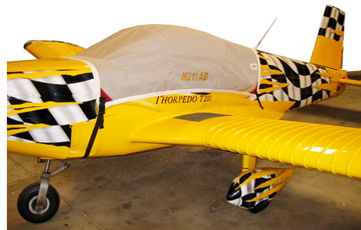
Indus Thorpedo Canopy Cover