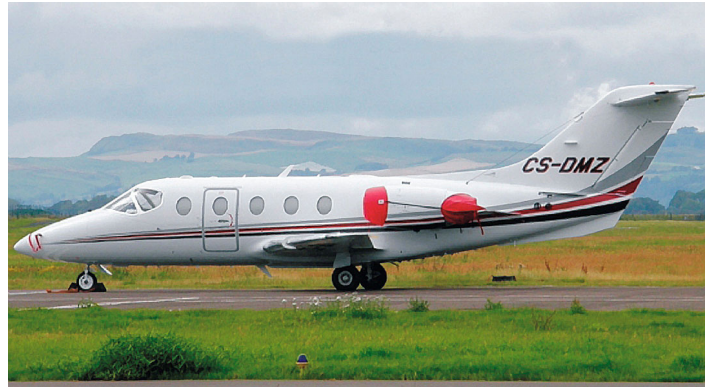
Beechjet 400 Engine & Pitot Covers