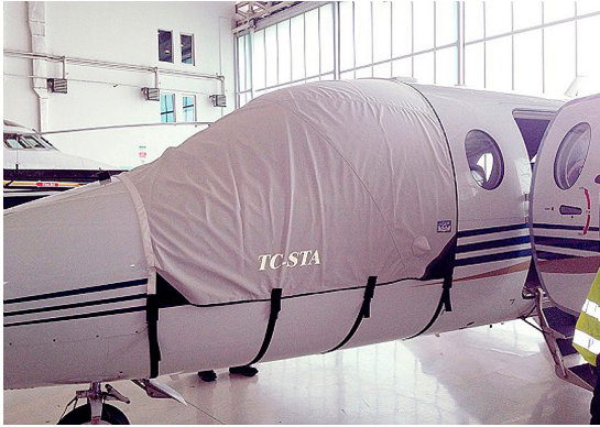
Beechjet 400A Cockpit Cover

This cover type is made from Silver Acrylic Sunbrella canvas and is 100% lined with a soft and smooth microfiber. Bruce's Custom Covers developed this material combination especially for aircraft protection. The outer material is medium weight and treated for water resistance, UV resistance and anti-static buildup. The inner lining is a very soft and smooth microfiber to prevent scratching. The material is very reflective, and tests show that the cabin interior temperature can be reduced to near-ambient temperature on the hottest of days. It is water, ice and snow repellent, yet breathable to allow moisture to escape from between the cover and the aircraft surface.