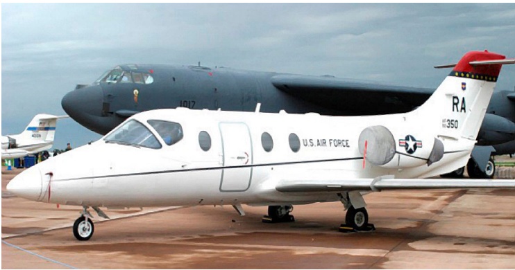
T-1A Jayhawk (Beechjet) Engine & Pitot Cover set

of medium weight nylon which is available in a variety of colors to match the paint trim. Each cover set comes complete with installation and folding instructions. The aircraft's registration number can be silkscreened onto the cover for an extra charge.