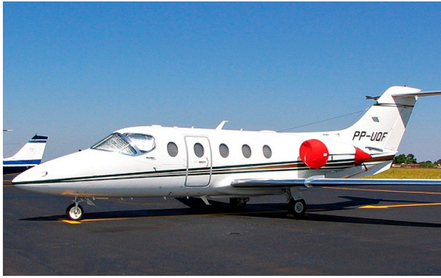
Beechjet 400 Engine Covers & Cockpit HeatShields

of medium weight nylon which is available in a variety of colors to match the paint trim. Each cover set comes complete with installation and folding instructions. The aircraft's registration number can be silkscreened onto the cover for an extra charge.