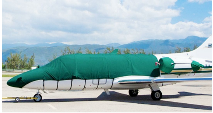
Raytheon Beechjet 400 Fuselage/Nose Cover, Engine Covers