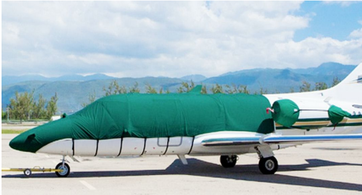
Raytheon Beechjet 400 Fuselage/Nose Cover, Engine Covers

This cover type is made from Silver Acrylic Sunbrella canvas and is 100% lined with a soft and smooth microfiber. Bruce's Custom Covers developed this material combination especially for aircraft protection. The outer material is medium weight and treated for water resistance, UV resistance and anti-static buildup. The inner lining is a very soft and smooth microfiber to prevent scratching. The material is very reflective, and tests show that the cabin interior temperature can be reduced to near-ambient temperature on the hottest of days. It is water, ice and snow repellent, yet breathable to allow moisture to escape from between the cover and the aircraft surface.