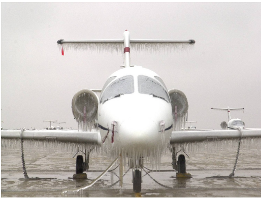
Beechjet 400 Engine Covers