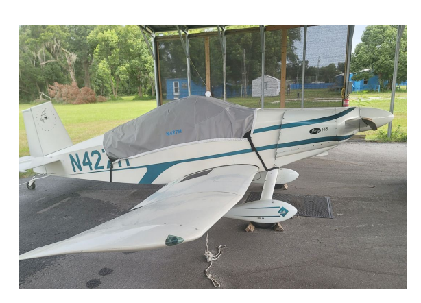
Thorp T-18 Travel Cover