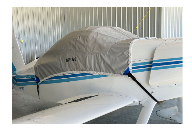
T-18 Travel Cover, Light Weight Canopy Cover (Bubble Canopy)

Travel Covers are made with Silver Solution-Dyed Polyester fabric and only lined over the windshield to save weight. The material is lightweight and more compact for easy stowage in the aircraft. The polyester material is water resistant, but only intended for occasional use outside. We also have an ultra lightweight material available for fitted hangar dust covers. For daily outdoor use, the non-travel Sunbrella Cover is the best choice.