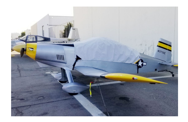
Bushby Mustang Complete Fuselage Cover with Detachable Wing Covers