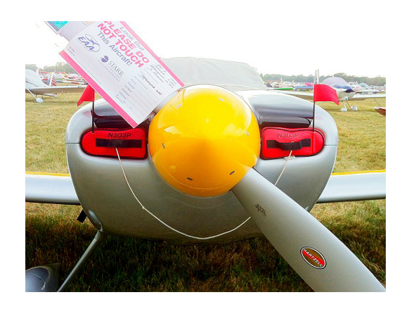
Vans's RV-7 Engine Engine Inlet Plugs