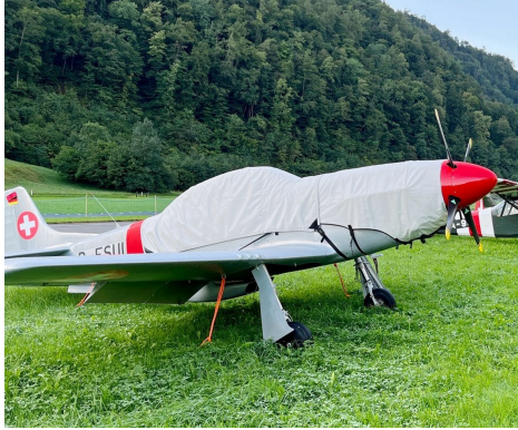
Stewart S-51 Canopy & Engine Covers

This cover type is made from Silver Acrylic Sunbrella canvas and is 100% lined with a soft and smooth microfiber. Bruce's Custom Covers developed this material combination especially for aircraft protection. The outer material is medium weight and treated for water resistance, UV resistance and anti-static buildup. The inner lining is a very soft and smooth microfiber to prevent scratching. The material is very reflective, and tests show that the cabin interior temperature can be reduced to near-ambient temperature on the hottest of days. It is water, ice and snow repellent, yet breathable to allow moisture to escape from between the cover and the aircraft surface.