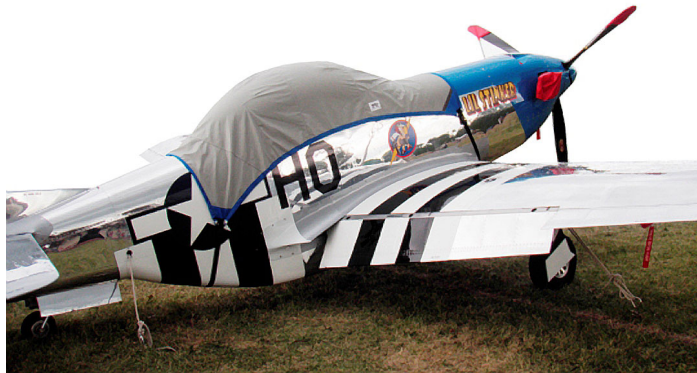
Stewart Mustang Canopy Cover, Prop Tie Downs & Intake Plugs

Covers developed this material combination especially for aircraft protection. The outer material is medium weight and treated for water resistance, UV resistance and anti-static buildup. The inner lining is a very soft and smooth microfiber to prevent scratching. The material is very reflective, and tests show that the cabin interior temperature can be reduced to near-ambient temperature on the hottest of days. It is water, ice and snow repellent, yet breathable to allow moisture to escape from between the cover and the aircraft surface.