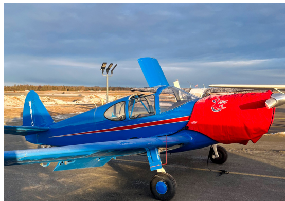
Globe Swift Insulated Engine Cover

This cover type is made from Silver Acrylic Sunbrella canvas and is 100% lined with a soft and smooth microfiber. Bruce's Custom Covers developed this material combination especially for aircraft protection. The outer material is medium weight and treated for water resistance, UV resistance and anti-static buildup. The inner lining is a very soft and smooth microfiber to prevent scratching. The material is very reflective, and tests show that the cabin interior temperature can be reduced to near-ambient temperature on the hottest of days. It is water, ice and snow repellent, yet breathable to allow moisture to escape from between the cover and the aircraft surface.