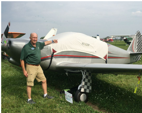
Globe Swift Canopy Cover

This cover type is made from Silver Acrylic Sunbrella canvas and is 100% lined with a soft and smooth microfiber. Bruce's Custom Covers developed this material combination especially for aircraft protection. The outer material is medium weight and treated for water resistance, UV resistance and anti-static buildup. The inner lining is a very soft and smooth microfiber to prevent scratching. The material is very reflective, and tests show that the cabin interior temperature can be reduced to near-ambient temperature on the hottest of days. It is water, ice and snow repellent, yet breathable to allow moisture to escape from between the cover and the aircraft surface.