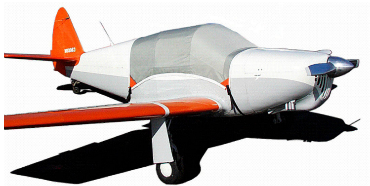
Standard Canopy Cover for Swift