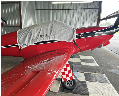
Swift Travel Cover, Light Weight Canopy Cover (Standard Canopy)