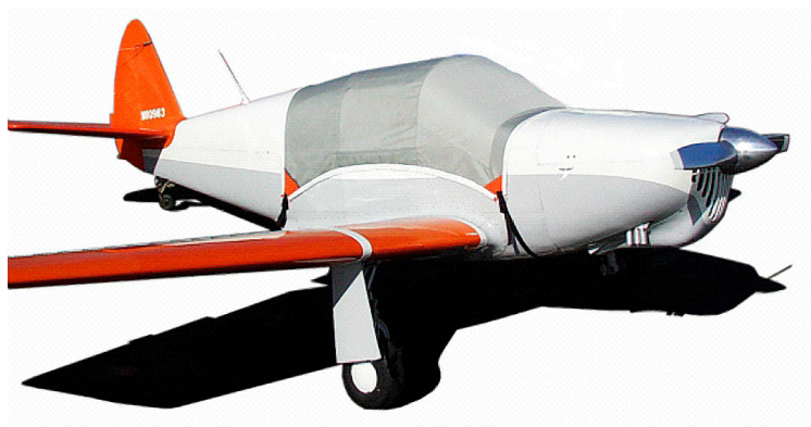
Standard Canopy Cover for Swift

Travel Covers are made with Silver Solution-Dyed Polyester fabric and only lined over the windshield to save weight. The material is lightweight and more compact for easy stowage in the aircraft. The polyester material is water resistant, but only intended for occasional use outside. We also have an ultra lightweight material available for fitted hangar dust covers. For daily outdoor use, the non-travel Sunbrella Cover is the best choice.