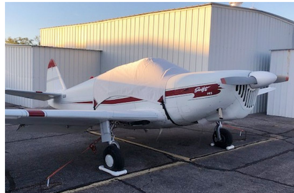
Globe-Temco Swift Canopy Cover, standard type