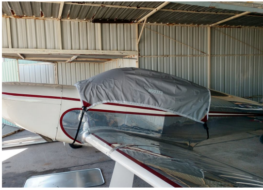
Globe GC-1B Lightweight Travel Cover