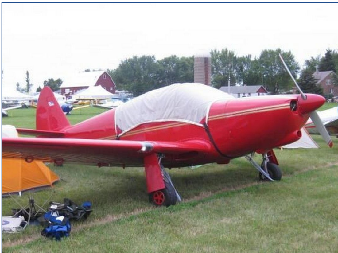
Globe Swift Canopy Cover