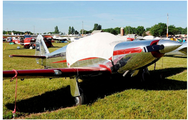
Standard Canopy Cover for Swift