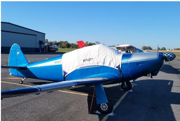
Swift GC-1B Canopy Cover

This cover type is made from Silver Acrylic Sunbrella canvas and is 100% lined with a soft and smooth microfiber. Bruce's Custom Covers developed this material combination especially for aircraft protection. The outer material is medium weight and treated for water resistance, UV resistance and anti-static buildup. The inner lining is a very soft and smooth microfiber to prevent scratching. The material is very reflective, and tests show that the cabin interior temperature can be reduced to near-ambient temperature on the hottest of days. It is water, ice and snow repellent, yet breathable to allow moisture to escape from between the cover and the aircraft surface.