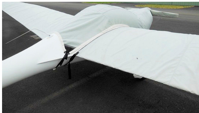
Lambda Canopy/Engine, Wing Covers