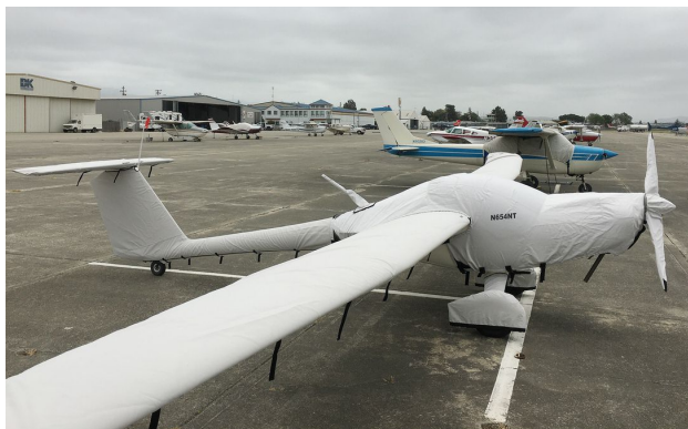
Distar Sundancer LSA Extended Canopy/Engine, Prop, Wheelpantz, Wings & Empennage Covers