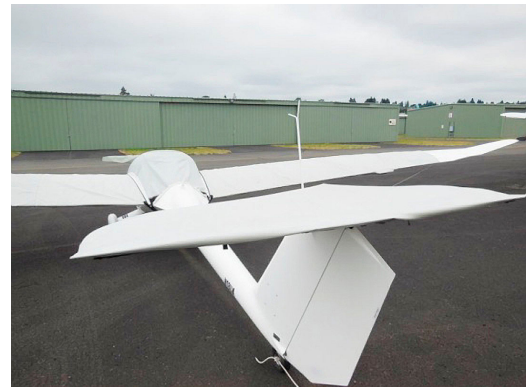
Lambda Canopy/Engine, Wing & Horiz. Stab. Covers