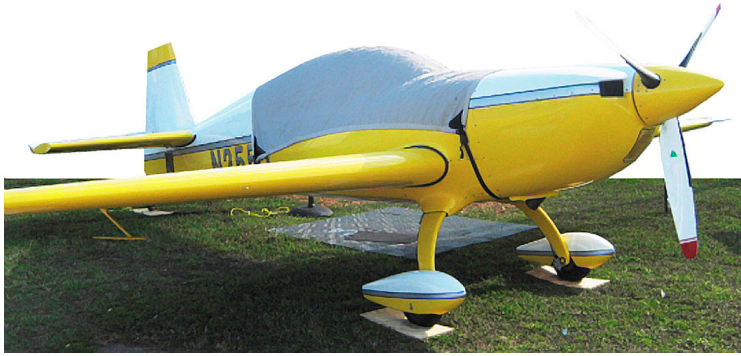
Extra 300/L Canopy Cover