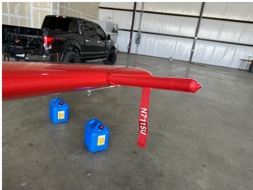
Sukhoi SU-26 Pitot Cover

Sukhoi SU-26 Pitot Tube Covers , NOT HEAT RESISTANT TYPE, are made of Naugahyde vinyl, and are designed to cover the entire pitot assembly. Slipping over the tube, the cover tightens around the base with a Velcro strap detail. A "Remove Before Flight" streamer is attached to the cover. Heat Resistant Pitot Covers are an upgrade to this design, and help prevent the pitot cover from melting onto the tube if the pitot heat is accidentally turned on while installed. If you want the set tethered together, please let us know.