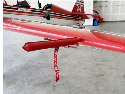
Sukhoi SU-26 Pitot Cover