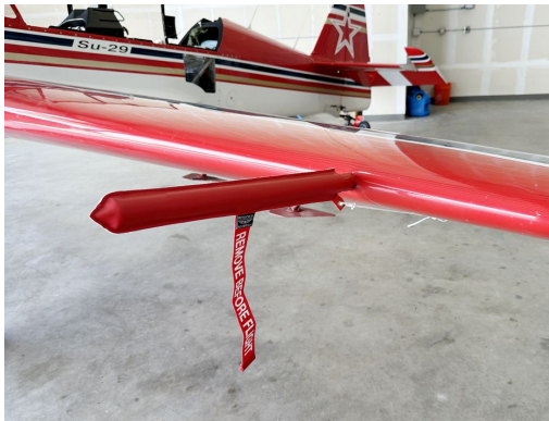
Sukhoi SU-26 Pitot Cover