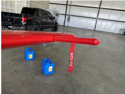
Sukhoi SU-26 Pitot Cover

Sukhoi SU-26 Pitot Tube Covers , NOT HEAT RESISTANT TYPE, are made of Naugahyde vinyl, and are designed to cover the entire pitot assembly. Slipping over the tube, the cover tightens around the base with a Velcro strap detail. A "Remove Before Flight" streamer is attached to the cover. Heat Resistant Pitot Covers are an upgrade to this design, and help prevent the pitot cover from melting onto the tube if the pitot heat is accidentally turned on while installed. If you want the set tethered together, please let us know.