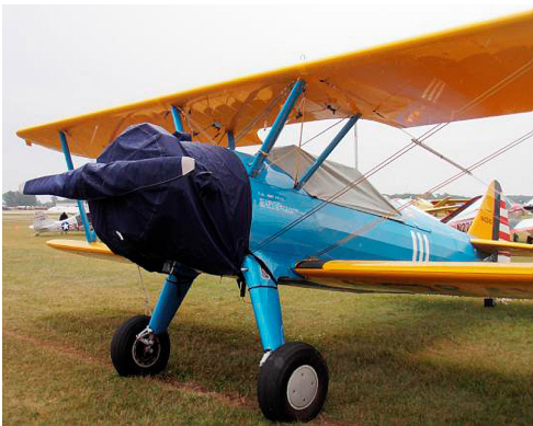
Stearman PT-13 Engine Cover