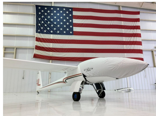
Stemme S-12 Canopy/Nose Cover