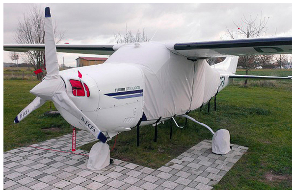
Cessna 210 Extended Canopy Cover, Engine Plugs, Prop and Tire Covers