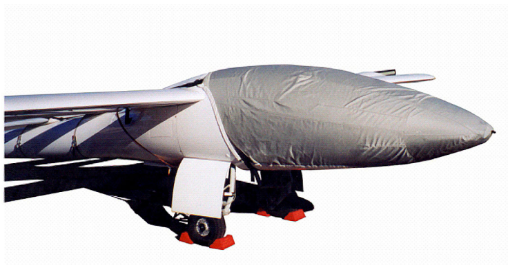
Stemme Cockpit/Nose Cover