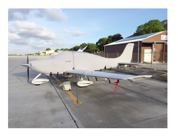
Cirrus SR-22 Full Cover Set