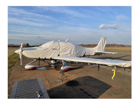
Cirrus SR-22 Complete Cover Set

WINTER USE MATERIAL - Made with Solution-Dyed Polyester fabric, this option is intended for seasonal use to aid in deicing, rain mitigation, or for occasional travel. The material is lighter and more compact, but more susceptible to UV damage and may have a shorter useful life if used continuously outside than the all-year use material.