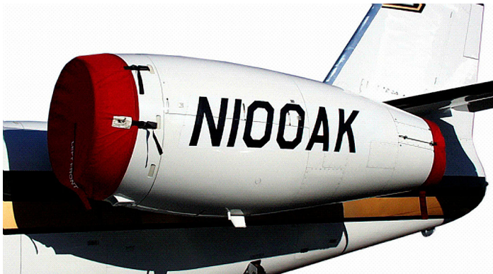
Engine Cover Set for the Astra

The Israel Aircraft Industries Astra SPX Bikini Style Engine Covers are a single-piece design using a soft and smooth stretchy fabric. The cover stretches tightly over both the intake and exhaust, installing quickly and easily. These covers are designed to be used as hangar dust covers and have a useful life of approximately one year.