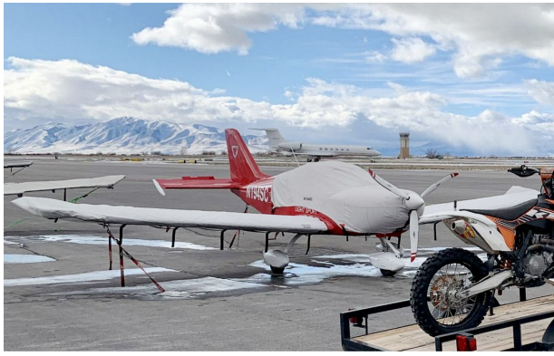
Czech Aircraft SportCruiser Canopy/Engine & Wing Covers