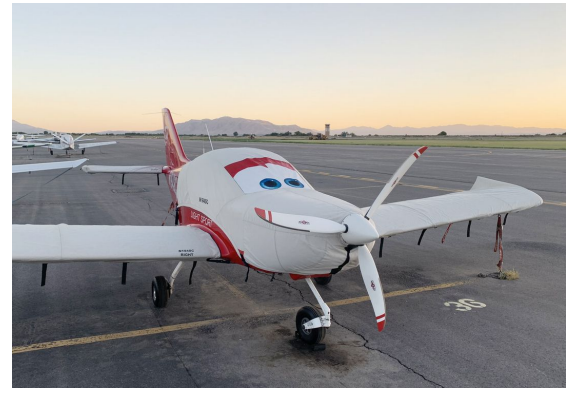
SportCruiser Canopy/Engine & Wing Covers