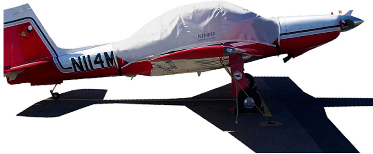
Micco SP20 Canopy Cover & Engine Inlet Plugs

The Micco SP20 Canopy/Engine Cover is a one-piece cover (100% lined with microfiber) that is a combination of the Canopy Cover and Engine Cover. This cover will enclose the engine cowl and will extend aft to cover all of the windows. This cover type is made from Silver Acrylic Sunbrella canvas and is 100% lined with a soft and smooth microfiber. Bruce's Custom Covers developed this material combination especially for aircraft protection. The outer material is medium weight and treated for water resistance, UV resistance and anti-static buildup. The inner lining is a very soft and smooth microfiber to prevent scratching. The material is very reflective, and tests show that the cabin interior temperature can be reduced to near-ambient temperature on the hottest of days. It is water, ice and snow repellent, yet breathable to allow moisture to escape from between the cover and the aircraft surface.