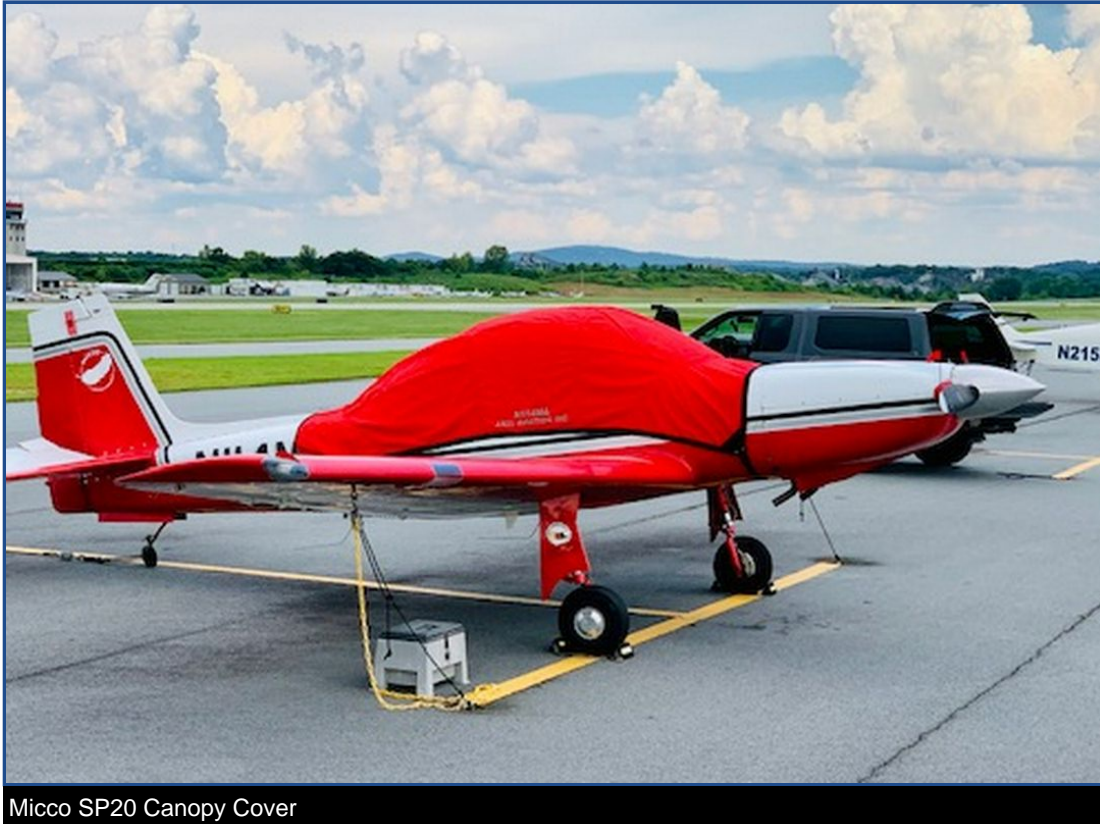
Micco SP20 Canopy Cover