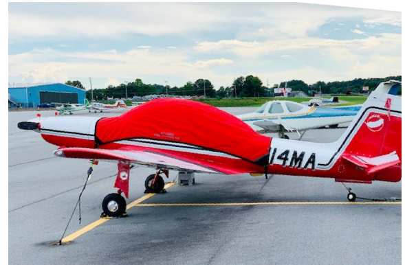
Micco SP20 Canopy Cover