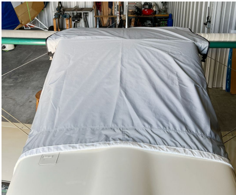
Sorrell SNS-7 Hiperbiplane Over The Top Travel Canopy Cover

Travel Covers are made with Silver Solution-Dyed Polyester fabric and only lined over the windshield to save weight. The material is lightweight and more compact for easy stowage in the aircraft. The polyester material is water resistant, but only intended for occasional use outside. We also have an ultra lightweight material available for fitted hangar dust covers. For daily outdoor use, the non-travel Sunbrella Cover is the best choice.