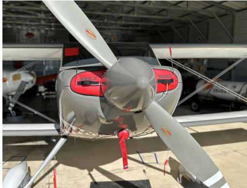
SNS-7 HiperBipe Engine Inlet Plugs

Engine Inlet Plugs are custom fit for your Sorrell Hiperbipe SNS-7 intakes, made with heavy-duty vinyl material, and stuffed with a single block of sculpted urethane foam. Each plug has a zipper that allows the foam to be removed and dried if necessary. Engine plugs have warning flags that are visible from the cockpit or 'remove before flight' streamers sewn onto the face of the plugs. Most plugs are imprinted with the aircraft registration number in black for an extra charge. Storage bag NOT included. Engine plugs may be inserted after flight when the engine is still warm. Engine Inlet Plugs are commonly referred to as Cowl Plugs, Intake Plugs, Cowl Blocks, Engine Blocks, and Engine Bungs.