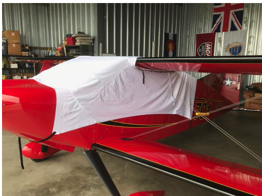
Sorrell Hiperbipe Canopy Cover (test fit cover)

Travel Covers are made with Silver Solution-Dyed Polyester fabric and only lined over the windshield to save weight. The material is lightweight and more compact for easy stowage in the aircraft. The polyester material is water resistant, but only intended for occasional use outside. We also have an ultra lightweight material available for fitted hangar dust covers. For daily outdoor use, the non-travel Sunbrella Cover is the best choice.