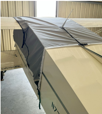
Sorrell SNS-7 Hiperbiplane Over The Top Travel Canopy Cover