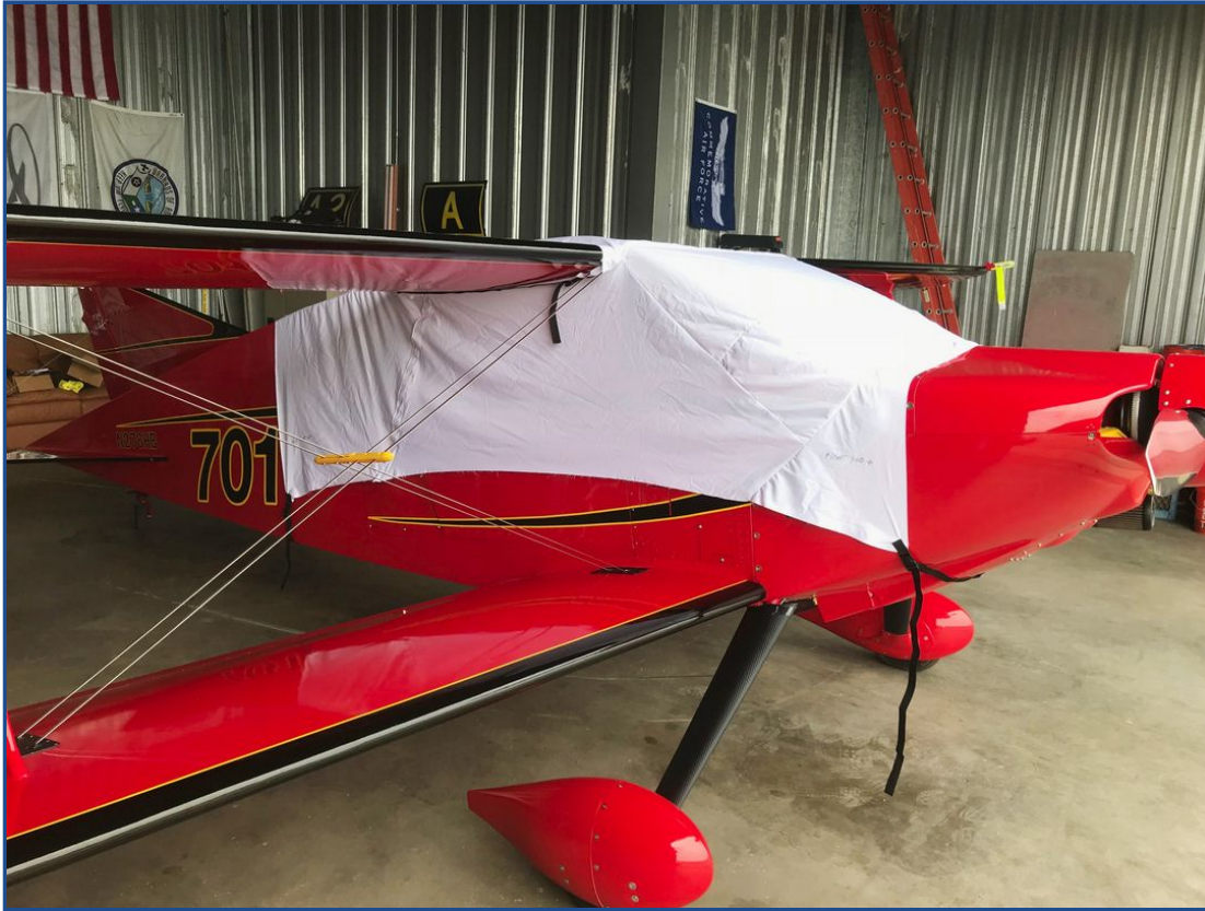
Sorrell Hiperbipe Canopy Cover (test fit cover)