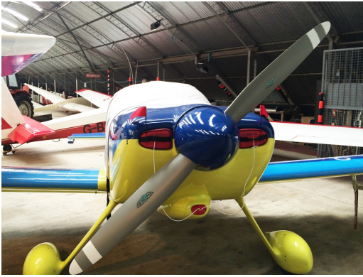
Van's RV-6 Engine Inlet Plugs

Engine Inlet Plugs are custom fit for your Sorrell Hiperbipe SNS-7 intakes, made with heavy-duty vinyl material, and stuffed with a single block of sculpted urethane foam. Each plug has a zipper that allows the foam to be removed and dried if necessary. Engine plugs have warning flags that are visible from the cockpit or 'remove before flight' streamers sewn onto the face of the plugs. Most plugs are imprinted with the aircraft registration number in black for an extra charge. Storage bag NOT included. Engine plugs may be inserted after flight when the engine is still warm. Engine Inlet Plugs are commonly referred to as Cowl Plugs, Intake Plugs, Cowl Blocks, Engine Blocks, and Engine Bungs.