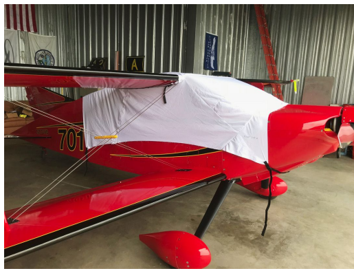
Sorrell Hiperbipe Canopy Cover (test fit cover)