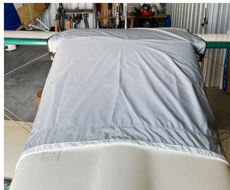
Sorrell SNS-7 Hiperbipe Over The Top Travel Canopy Cover