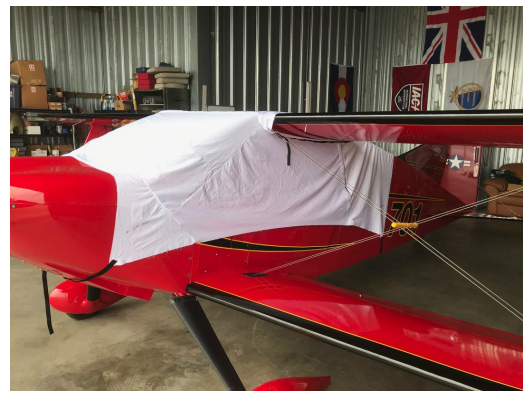
Sorrell Hiperbipe Canopy Cover (test fit cover)