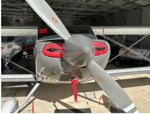
SNS-7 HiperBipe Engine Inlet Plugs

Engine Inlet Plugs are custom fit for your Sorrell Hiperbipe SNS-7 intakes, made with heavy-duty vinyl material, and stuffed with a single block of sculpted urethane foam. Each plug has a zipper that allows the foam to be removed and dried if necessary. Engine plugs have warning flags that are visible from the cockpit or 'remove before flight' streamers sewn onto the face of the plugs. Most plugs are imprinted with the aircraft registration number in black for an extra charge. Storage bag NOT included. Engine plugs may be inserted after flight when the engine is still warm. Engine Inlet Plugs are commonly referred to as Cowl Plugs, Intake Plugs, Cowl Blocks, Engine Blocks, and Engine Bungs.