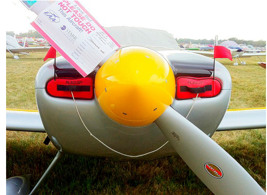
Vans's RV-7 Engine Engine Inlet Plugs