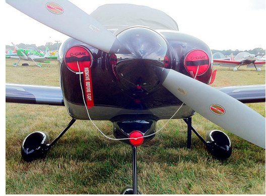
Van's RV-7 Engine Inlet Plugs