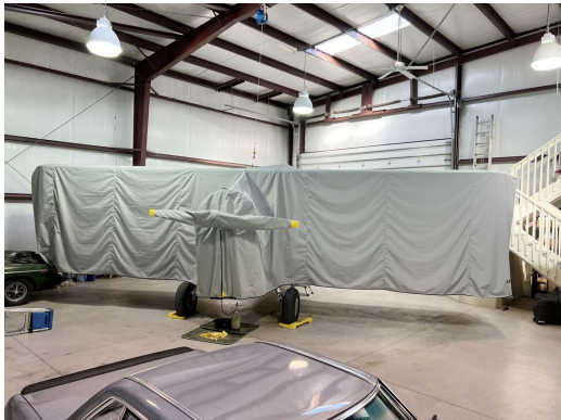
Stearman PT-13 Full Body Dust Cover

Some high value aircraft end up logging lots of hangar time, and become dust magnets in the process. A high quality, well fitting dust cover provides easy assurance that the aircraft's surfaces remain clean and free of grit and grime. Available in a large variety of colors, each dust cover is custom made according to aircraft details and customer preferences. Fire retardant fabrics are also available.