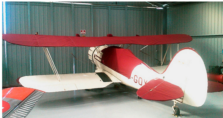
Waco UPF-7 Upper Wing Cover, Horizontal Stabilizer Cover & Canopy Cover

WINTER USE MATERIAL - Made with Solution-Dyed Polyester fabric, this option is intended for seasonal use to aid in deicing, rain mitigation, or for occasional travel. The material is lighter and more compact, but more susceptible to UV damage and may have a shorter useful life if used continuously outside than the all-year use material.