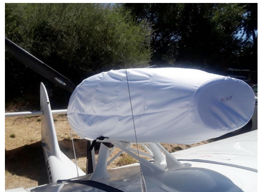
Seamax M22 Engine Cover, test fit cover