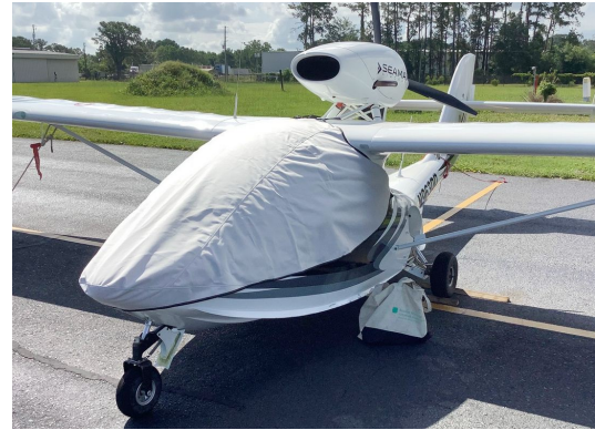
Seamax Canopy/Nose Cover