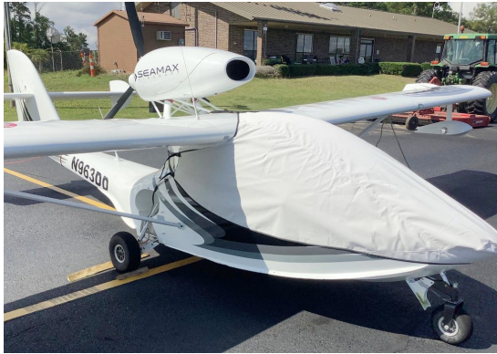
Seamax Canopy/Nose Cover

The material is very reflective, and tests show that the cabin interior temperature can be reduced to near-ambient temperature on the hottest of days. It is water, ice and snow repellent, yet breathable to allow moisture to escape from between the cover and the aircraft surface.