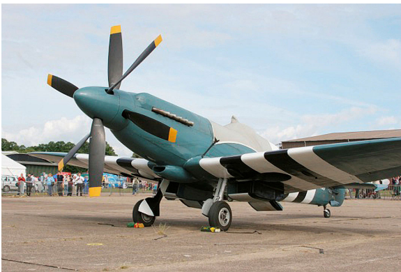
Supermarine Spitfire XIX Canopy Cover

Travel Covers are made with Silver Solution-Dyed Polyester fabric and only lined over the windshield to save weight. The material is lightweight and more compact for easy stowage in the aircraft. The polyester material is water resistant, but only intended for occasional use outside. We also have an ultra lightweight material available for fitted hangar dust covers. For daily outdoor use, the non-travel Sunbrella Cover is the best choice.