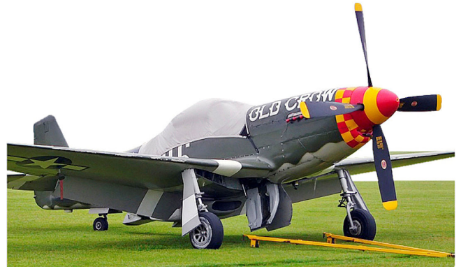
Canopy Cover, Chin Scoop & Exhaust Plugs