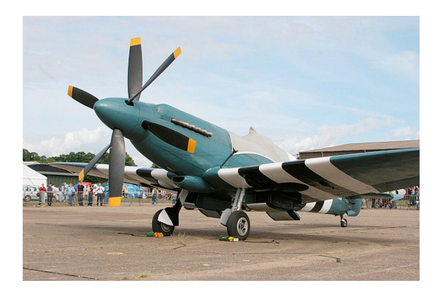
Supermarine Spitfire XIX Canopy Cover