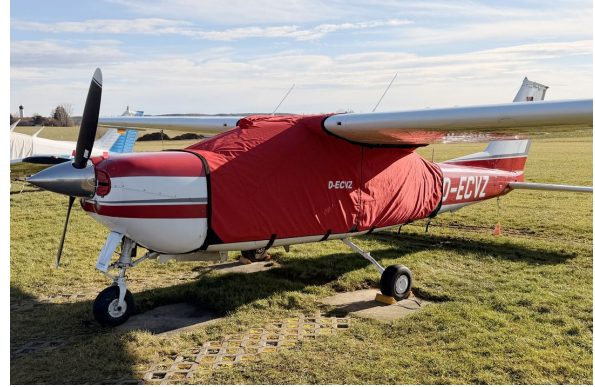
Cessna 177 Cardinal Extended Canopy Cover, Over Top Type