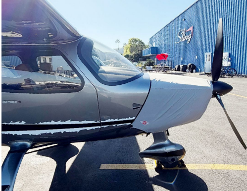
Sling High Wing Engine Cover

This cover type is made from Silver Acrylic Sunbrella canvas and is 100% lined with a soft and smooth microfiber. Bruce's Custom Covers developed this material combination especially for aircraft protection. The outer material is medium weight and treated for water resistance, UV resistance and anti-static buildup. The inner lining is a very soft and smooth microfiber to prevent scratching. The material is very reflective, and tests show that the cabin interior temperature can be reduced to near-ambient temperature on the hottest of days. It is water, ice and snow repellent, yet breathable to allow moisture to escape from between the cover and the aircraft surface.