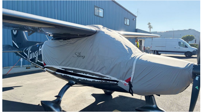
Sling High Wing Canopy Cover & Engine Cover