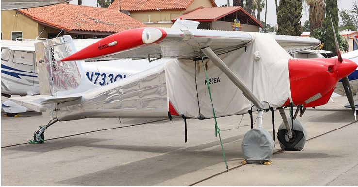
Murphy Elite Extended Canopy Cover

water resistance, UV resistance and anti-static buildup. The inner lining is a very soft and smooth microfiber to prevent scratching. The material is very reflective, and tests show that the cabin interior temperature can be reduced to near-ambient temperature on the hottest of days. It is water, ice and snow repellent, yet breathable to allow moisture to escape from between the cover and the aircraft surface.