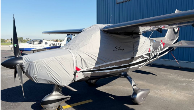
Sling High Wing Canopy Cover & Engine Cover

Travel Covers are made with Silver Solution-Dyed Polyester fabric and only lined over the windshield to save weight. The material is lightweight and more compact for easy stowage in the aircraft. The polyester material is water resistant, but only intended for occasional use outside. We also have an ultra lightweight material available for fitted hangar dust covers. For daily outdoor use, the non-travel Sunbrella Cover is the best choice.