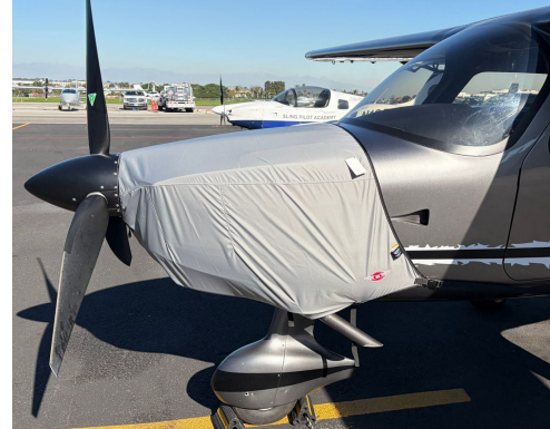
Sling High Wing Engine Cover