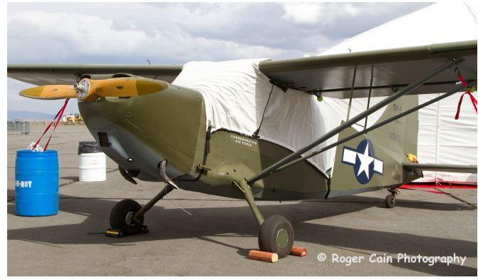
Stinson L-5 Canopy Cover