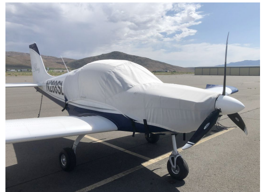
Sling 2 Canopy/Engine Cover