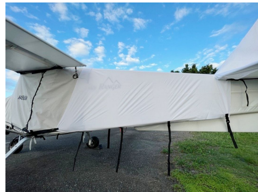
Best Off Skyranger Empennage Cover, test fit cover