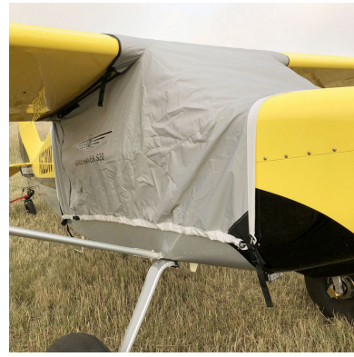
Rans S-20 Raven Travel Cover, Light Weight Travel Canopy Cover