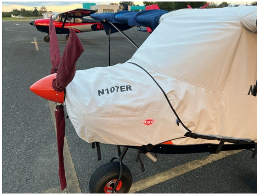
Best Off Skyranger Canopy Cover, Engine Cover