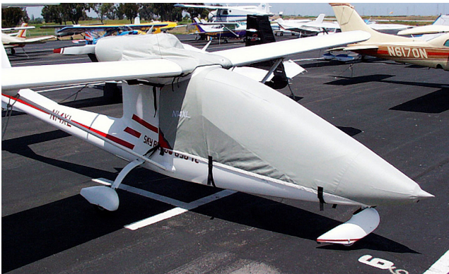
Sky Arrow Canopy & Engine Covers

This cover type is made from Silver Acrylic Sunbrella canvas and is 100% lined with a soft and smooth microfiber. Bruce's Custom Covers developed this material combination especially for aircraft protection. The outer material is medium weight and treated for water resistance, UV resistance and anti-static buildup. The inner lining is a very soft and smooth microfiber to prevent scratching. The material is very reflective, and tests show that the cabin interior temperature can be reduced to near-ambient temperature on the hottest of days. It is water, ice and snow repellent, yet breathable to allow moisture to escape from between the cover and the aircraft surface.