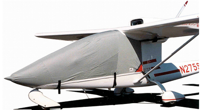
Sky Arrow Standard Canopy Cover