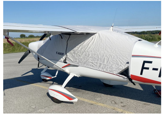
Tecnam P2010 Over-Top Canopy Cover