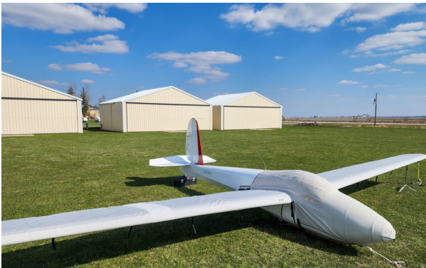
Schweizer 1-26 Canopy/Nose Cover, Wing Covers

WINTER USE MATERIAL - Made with Solution-Dyed Polyester fabric, this option is intended for seasonal use to aid in deicing, rain mitigation, or for occasional travel. The material is lighter and more compact, but more susceptible to UV damage and may have a shorter useful life if used continuously outside than the all-year use material.