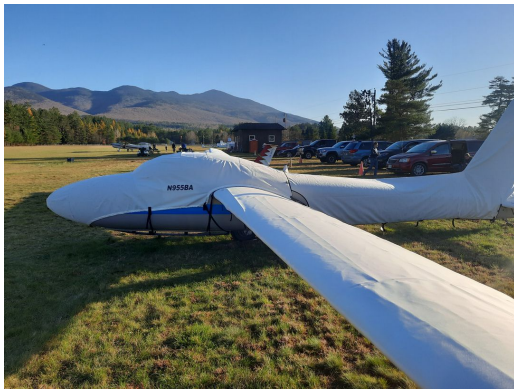
Schweizer 2-32 Full Cover Set

WINTER USE MATERIAL - Made with Solution-Dyed Polyester fabric, this option is intended for seasonal use to aid in deicing, rain mitigation, or for occasional travel. The material is lighter and more compact, but more susceptible to UV damage and may have a shorter useful life if used continuously outside than the all-year use material.