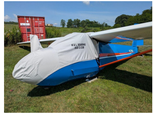
Schweizer Canopy/Nose Cover, 2-33B