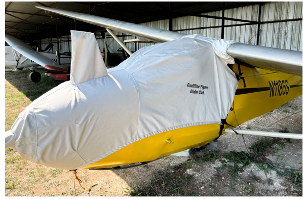
Schweizer SGS 2-33A Canopy/Nose Cover, All Year Use