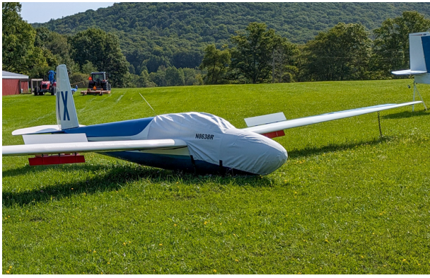
Schweizer 1-23H-15 Canopy/Nose Cover