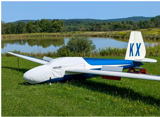
Schweizer 1-23H-15 Canopy/Nose Cover

the hottest of days. It is water, ice and snow repellent, yet breathable to allow moisture to escape from between the cover and the aircraft surface.