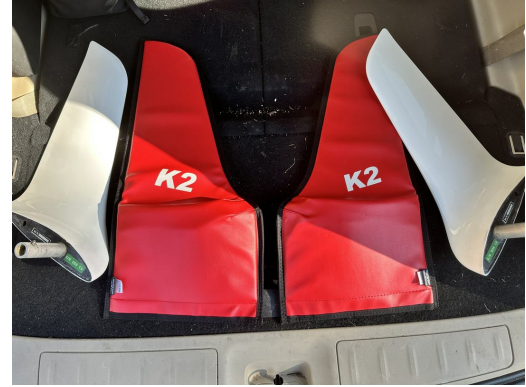
Discus CS Wingtip Pads (Set of 2)