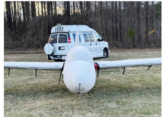
Schweizer SGS 2-32 Complete Cover Set