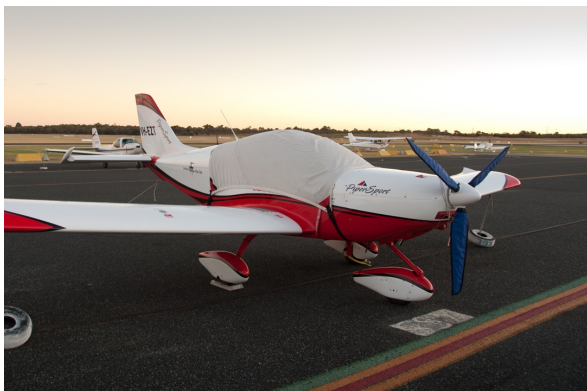
PiperSport Canopy Cover, Engine Plugs

This cover type is made from Silver Acrylic Sunbrella canvas and is 100% lined with a soft and smooth microfiber. Bruce's Custom Covers developed this material combination especially for aircraft protection. The outer material is medium weight and treated for water resistance, UV resistance and anti-static buildup. The inner lining is a very soft and smooth microfiber to prevent scratching. The material is very reflective, and tests show that the cabin interior temperature can be reduced to near-ambient temperature on the hottest of days. It is water, ice and snow repellent, yet breathable to allow moisture to escape from between the cover and the aircraft surface.