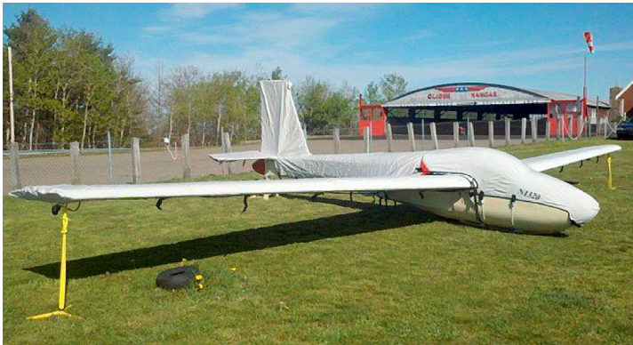
Schweizer 1-26B Canopy/Nose, Empennage & Wing Covers