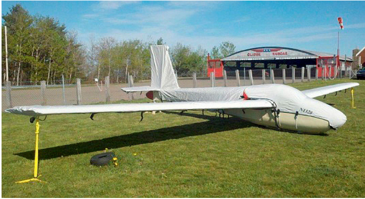
Schweizer 1-26B Canopy/Nose, Empennage & Wing Covers