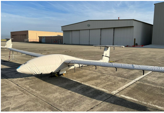
Schempp-Hirth Discus 2B Complete Cover Set