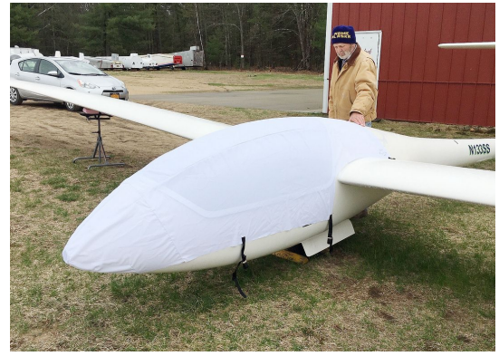
Grob 102 Astir CS Canopy/Nose Cover (test fit)