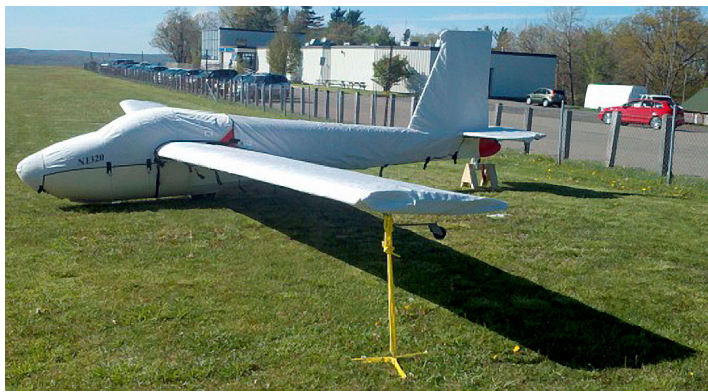
SGS 1-26B Canopy/Nose, Empennage & Wing Covers