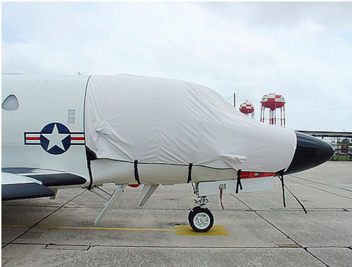
Sabre 40 Cockpit Cover

This cover type is made from Silver Acrylic Sunbrella canvas and is 100% lined with a soft and smooth microfiber. Bruce's Custom Covers developed this material combination especially for aircraft protection. The outer material is medium weight and treated for water resistance, UV resistance and anti-static buildup. The inner lining is a very soft and smooth microfiber to prevent scratching. The material is very reflective, and tests show that the cabin interior temperature can be reduced to near-ambient temperature on the hottest of days. It is water, ice and snow repellent, yet breathable to allow moisture to escape from between the cover and the aircraft surface.