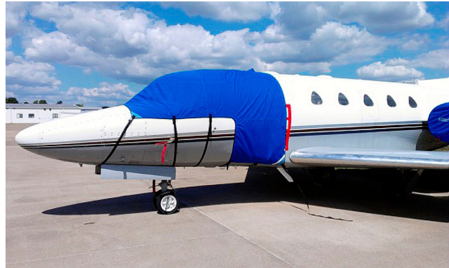
Rockwell Sabre Cockpit/Door Cover