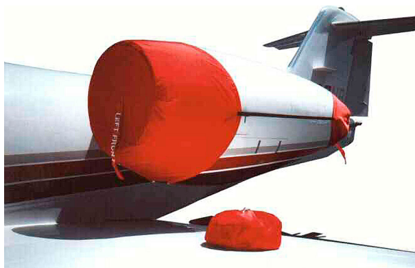
Lear 30 Tri-Fold Engine Cover

The Rockwell Sabre 40, 65, 75, 80 Bikini Style Engine Covers are a single-piece design using a soft and smooth stretchy and fabric. The cover stretches tightly over both the intake and exhaust, installing quickly and easily. These covers are designed to be used as hangar dust covers and have a useful life of approximately one year.