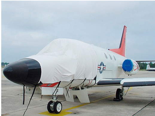
Sabre 40 Cockpit and Engine Covers set

This cover type is made from Silver Acrylic Sunbrella canvas and is 100% lined with a soft and smooth microfiber. Bruce's Custom Covers developed this material combination especially for aircraft protection. The outer material is medium weight and treated for water resistance, UV resistance and anti-static buildup. The inner lining is a very soft and smooth microfiber to prevent scratching. The material is very reflective, and tests show that the cabin interior temperature can be reduced to near-ambient temperature on the hottest of days. It is water, ice and snow repellent, yet breathable to allow moisture to escape from between the cover and the aircraft surface.