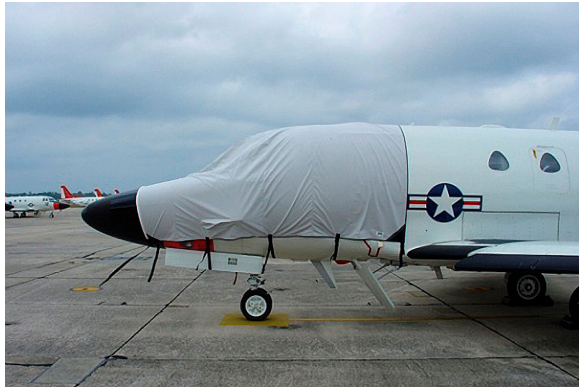
Sabre 40 Cockpit Cover