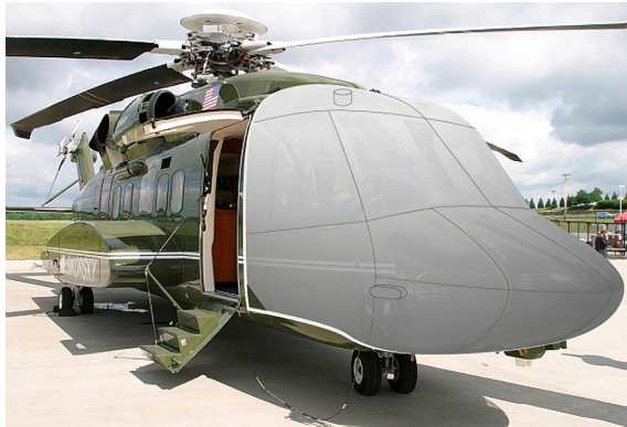
Sikorsky S-92 Windshield/Nose Cover (illustration)

This cover type is made from Silver Acrylic Sunbrella canvas and is 100% lined with a soft and smooth microfiber. Bruce's Custom Covers developed this material combination especially for aircraft protection. The outer material is medium weight and treated for water resistance, UV resistance and anti-static buildup. The inner lining is a very soft and smooth microfiber to prevent scratching. The material is very reflective, and tests show that the cabin interior temperature can be reduced to near-ambient temperature on the hottest of days. It is water, ice and snow repellent, yet breathable to allow moisture to escape from between the cover and the aircraft surface.