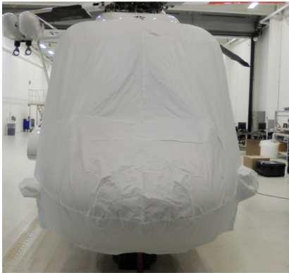
Sikorsky S-92 Windshield/Nose Cover, test fit cover