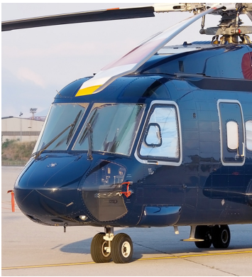
Sikorsky S-92 Cockpit HeatShields

storage sleeve. Some designs may require velcro and suction cups. A Heatshield is an excellent short-term remedy for cockpit overheating, but an external fabric cover is more effective for long-term protection.