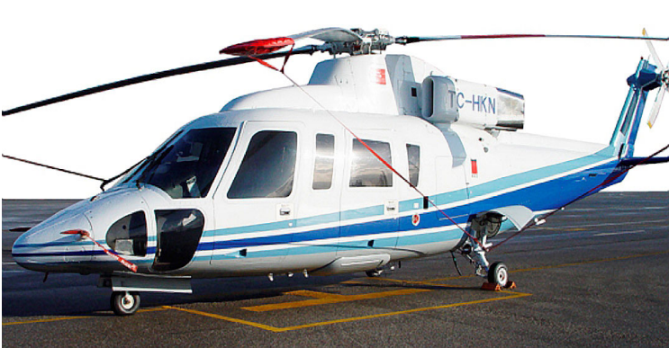
S76 Forward Fuselage, Engine, Main & Tail Rotor Hub Covers (illustration)