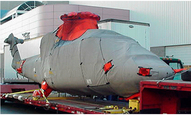
S76 Full Body Transport Cover