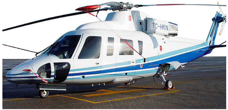
S76 Blade Tie-Downs and Pitot Cover set