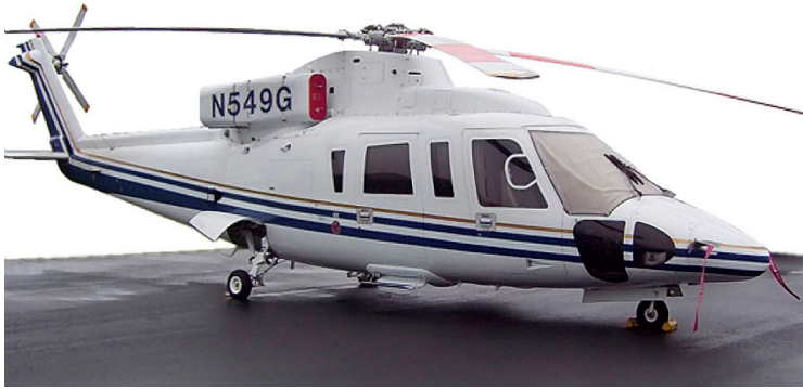
Sikorsky S76 Snap-On Windshield Cover