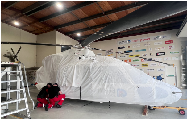
Sikorsky S76C Forward Canopy Cover, Engine Cover (test fit covers)