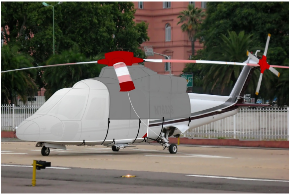
S76 Forward Fuselage, Engine, Main & Tail Rotor Hub Covers (illustration)