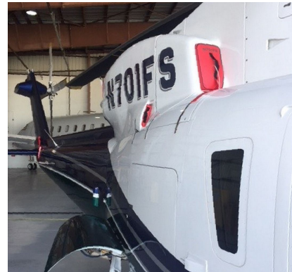
Sikorsky S76 (All Models) Intake Plugs (S76c Models)