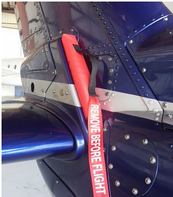
S76 Tail Wedge Plug

The Engine Inlet Plugs are custom fit for your Sikorsky S76 (All Models) intakes, made with heavy-duty vinyl material, and stuffed with a single block of sculpted urethane foam. Each plug has a zipper that allows the foam to be removed and dried if necessary. Engine plugs have 'Remove Before Flight' streamers sewn onto the face of the plugs. Most plugs are imprinted with the aircraft registration number in black for an extra charge. Storage bag NOT included. Engine plugs may be inserted after flight when the engine is still warm. Engine Inlet Plugs are commonly referred to as Cowl Plugs, Intake Plugs, Cowl Blocks, Engine Blocks, and Engine Bungs.