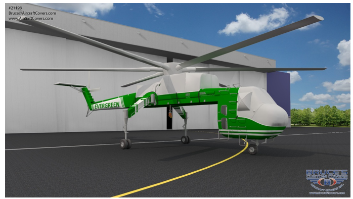
Sikorsky S-64 Canopy/Nose, Engine Area, Blade, Rotor, Tail Rotor Covers (illustration)