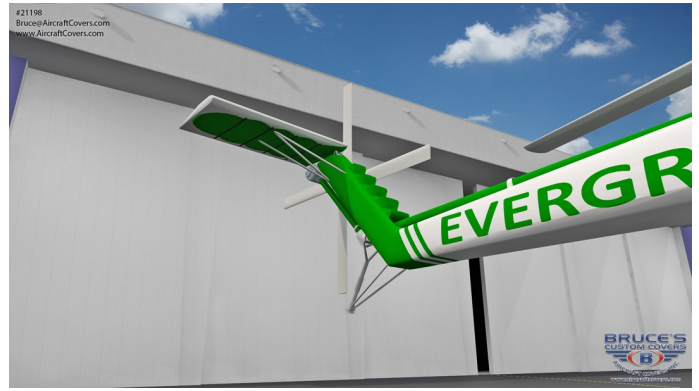
Sikorsky S-64 Skycrane, CH-54 Tarhe Insulated Engine, Rotor Sikorsky S-64 Canopy/Nose, Engine Area, Blade, Rotor, Tail Rotor Hub, Tailboom, Stabilizer & Tail Rotor Covers Sikorsky S-64 Canopy/Nose, Engine Area, Blade, Rotor, Tail Rotor Covers (illustration)