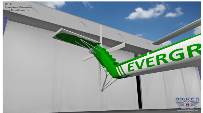
Sikorsky S-64 Skycrane, CH-54 Tarhe Insulated Engine, Rotor Sikorsky S-64 Canopy/Nose, Engine Area, Blade, Rotor, Tail Rotor Hub, Tailboom, Stabilizer & Tail Rotor Covers Sikorsky S-64 Canopy/Nose, Engine Area, Blade, Rotor, Tail Rotor Covers (illustration)