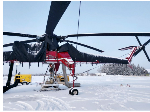
Sikorsky S-64 Skycrane, CH-54 Tarhe Insulated Engine, Rotor Hub, Tailboom, Stabilizer & Tail Rotor Covers