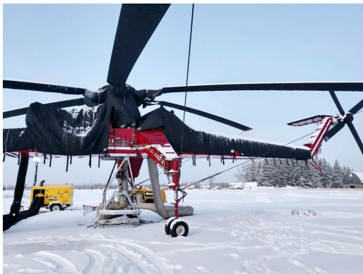
Sikorsky S-64 Skycrane, CH-54 Tarhe Insulated Engine, Rotor Sikorsky S-64 Canopy/Nose, Engine Area, Blade, Rotor, Tail Rotor Hub, Tailboom, Stabilizer & Tail Rotor Covers

The Tailboom Cover details vary by model, but generally the helicopter tail boom cover encloses the tail boom from the "bottleneck" to the aft end. They usually also cover the horizontal stabilizers, and are custom made to allow for antennae, lights, and other protrusions. They attach with straps underneath the tail boom. Covers for the vertical and horizontal stabilizers are also available separately. Specific information for each model is available on request.