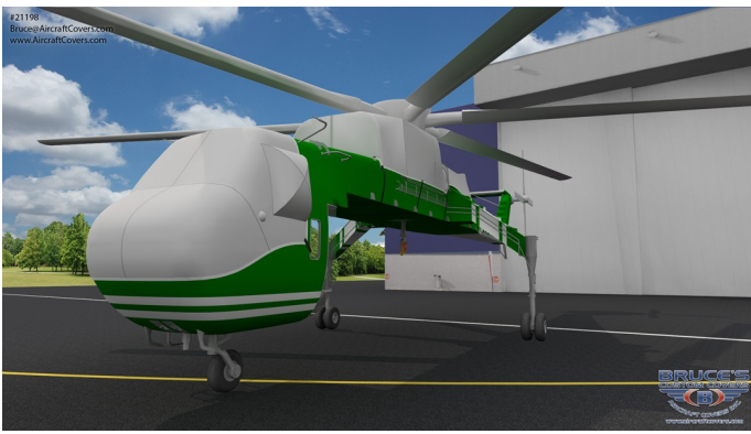
Sikorsky S-64 Canopy/Nose, Engine Area, Blade, Rotor, Tail Rotor Covers (illustration)