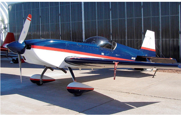
Covers & Plugs for the Staudacher S-600