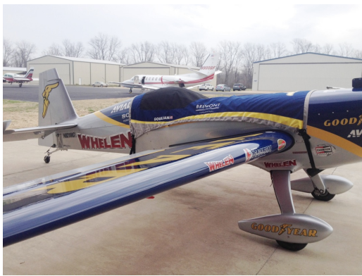
Extra 300SC with NASCAR style custom cover