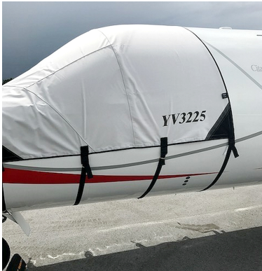
Cessna Citationjet V Ultra (560) Cockpit Cover

This cover type is made from Silver Acrylic Sunbrella canvas and is 100% lined with a soft and smooth microfiber. Bruce's Custom Covers developed this material combination especially for aircraft protection. The outer material is medium weight and treated for water resistance, UV resistance and anti-static buildup. The inner lining is a very soft and smooth microfiber to prevent scratching. The material is very reflective, and tests show that the cabin interior temperature can be reduced to near-ambient temperature on the hottest of days. It is water, ice and snow repellent, yet breathable to allow moisture to escape from between the cover and the aircraft surface.