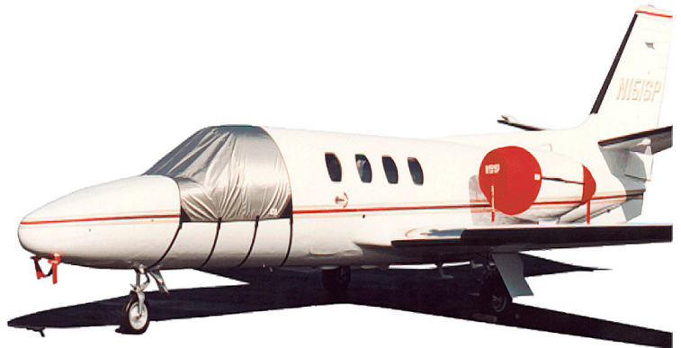
Cessna Citation I Windshield, Pitot and Engine Covers