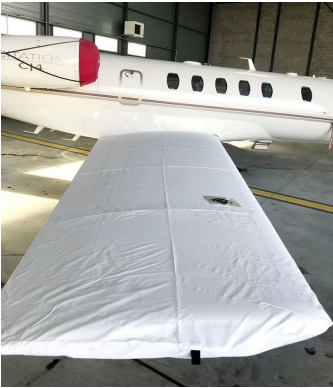
Cessna Citation CJ-4 Wing Covers, test fit cover

WINTER USE MATERIAL - Made with Solution-Dyed Polyester fabric, this option is intended for seasonal use to aid in deicing, rain mitigation, or for occasional travel. The material is lighter and more compact, but more susceptible to UV damage and may have a shorter useful life if used continuously outside than the all-year use material.