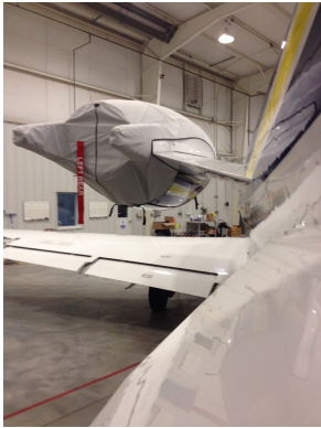
Cessna Citation 560XL Upper Nacelle/Brightwork Covers

and dried if necessary. Engine plugs have 'remove before flight' streamers sewn onto the face of the plugs. Most plugs are imprinted with the aircraft registration number in black. Engine plugs may be inserted after flight when the engine is still warm. Engine Inlet Plugs are commonly referred to as Cowl Plugs, Intake Plugs, Cowl Blocks, Engine Blocks, and Engine Bungs.