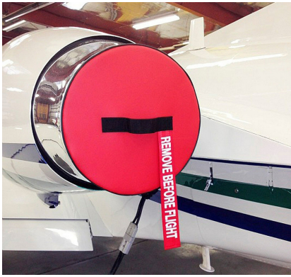
Cessna Citation S2 Exhaust Plugs