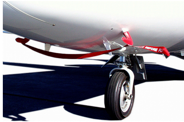
Cessna Citation I Pitot Covers