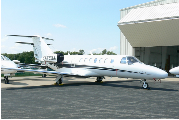
Cessna Citation CJ3 Bikini Style Engine Covers

and dried if necessary. Engine plugs have 'remove before flight' streamers sewn onto the face of the plugs. Most plugs are imprinted with the aircraft registration number in black. Engine plugs may be inserted after flight when the engine is still warm. Engine Inlet Plugs are commonly referred to as Cowl Plugs, Intake Plugs, Cowl Blocks, Engine Blocks, and Engine Bungs.