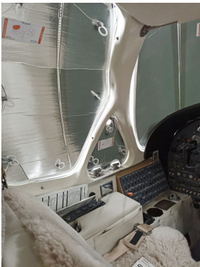
Cessna Citation I & II Cockpit HeatShields

Custom-made Heatshield Sunshades are available for almost any window in the jet. Side windows, Skylights, and Emergency Exits are all custom-made. The product is a unique composite of closed-cell foam with a silver mylar finish. The set is easily stored in the included storage sleeve. Some designs may require velcro and suction cups. Our Heatshields are offered white side out since aircraft manufacturers have issued advisories against reflective window inserts due to potential heat damage.