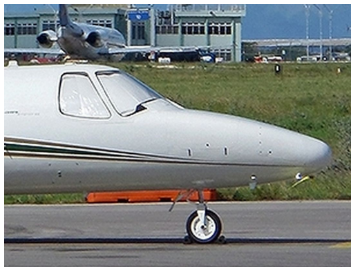
Cessna Citation S550 Cockpit HeatShields

Custom-made Heatshield Sunshades are available for almost any window in the jet. Side windows, Skylights, and Emergency Exits are all custom-made. The product is a unique composite of closed-cell foam with a silver mylar finish. The set is easily stored in the included storage sleeve. Some designs may require velcro and suction cups. Our Heatshields are offered white side out since aircraft manufacturers have issued advisories against reflective window inserts due to potential heat damage.