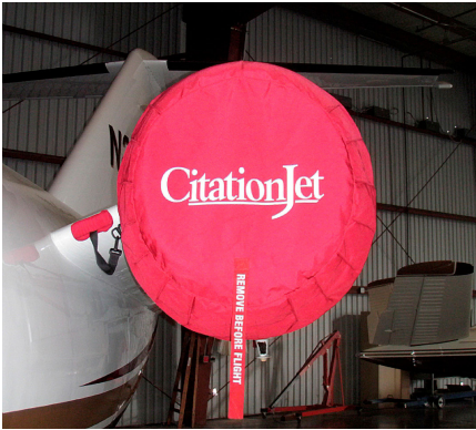
Cessna Citation Engine Cover Set