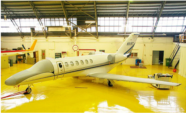
Cessna Citationjet CJ3 Cockpit/Nose, Engine & Wings Travel Covers