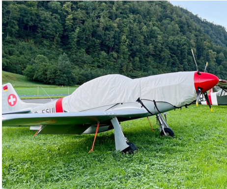
Stewart S-51 Canopy & Engine Covers

This cover type is made from Silver Acrylic Sunbrella canvas and is 100% lined with a soft and smooth microfiber. Bruce's Custom Covers developed this material combination especially for aircraft protection. The outer material is medium weight and treated for water resistance, UV resistance and anti-static buildup. The inner lining is a very soft and smooth microfiber to prevent scratching. The material is very reflective, and tests show that the cabin interior temperature can be reduced to near-ambient temperature on the hottest of days. It is water, ice and snow repellent, yet breathable to allow moisture to escape from between the cover and the aircraft surface.