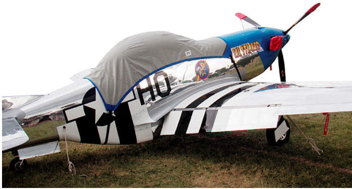
Stewart Mustang Canopy Cover, Prop Tie Downs & Intake Plugs

Covers developed this material combination especially for aircraft protection. The outer material is medium weight and treated for water resistance, UV resistance and anti-static buildup. The inner lining is a very soft and smooth microfiber to prevent scratching. The material is very reflective, and tests show that the cabin interior temperature can be reduced to near-ambient temperature on the hottest of days. It is water, ice and snow repellent, yet breathable to allow moisture to escape from between the cover and the aircraft surface.