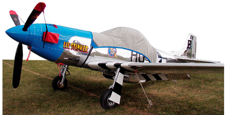
Stewart Mustang Canopy Cover, Prop Tie Downs & Intake Plugs