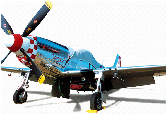
Canopy Cover, Belly & Chin Scoop Plugs

Covers developed this material combination especially for aircraft protection. The outer material is medium weight and treated for water resistance, UV resistance and anti-static buildup. The inner lining is a very soft and smooth microfiber to prevent scratching. The material is very reflective, and tests show that the cabin interior temperature can be reduced to near-ambient temperature on the hottest of days. It is water, ice and snow repellent, yet breathable to allow moisture to escape from between the cover and the aircraft surface.