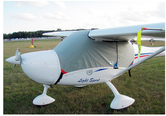
Remos G3 Travel Weight Canopy Cover