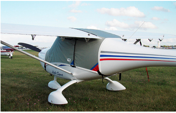
Remos G3 Travel Weight Canopy Cover