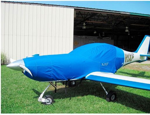
Arion Lightning Extended Canopy/Engine Cover