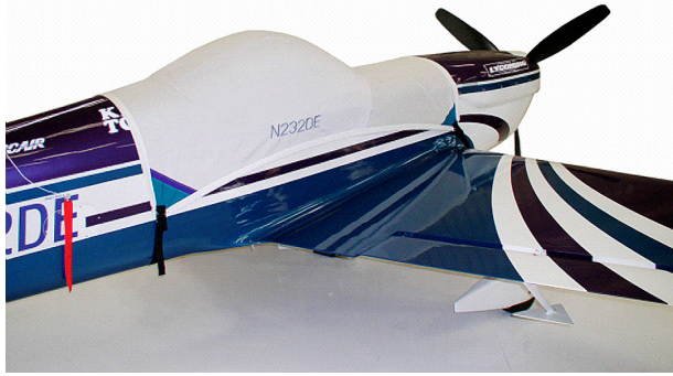
Cap 232 Canopy Cover