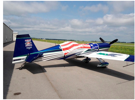
Extra 300SC Canopy Cover with custom artwork