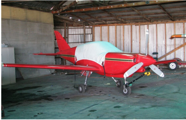
The Swearingen SX300 Canopy Cover

Travel Covers are made with Silver Solution-Dyed Polyester fabric and only lined over the windshield to save weight. The material is lightweight and more compact for easy stowage in the aircraft. The polyester material is water resistant, but only intended for occasional use outside. We also have an ultra lightweight material available for fitted hangar dust covers. For daily outdoor use, the non-travel Sunbrella Cover is the best choice.