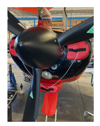
Siai Marchetti SF260 Engine Plugs

Engine Inlet Plugs are custom fit for your Siai Marchetti SF260 intakes, made with heavy-duty vinyl material, and stuffed with a single block of sculpted urethane foam. Each plug has a zipper that allows the foam to be removed and dried if necessary. Engine plugs have warning flags that are visible from the cockpit or 'remove before flight' streamers sewn onto the face of the plugs. Most plugs are imprinted with the aircraft registration number in black for an extra charge. Storage bag NOT included. Engine plugs may be inserted after flight when the engine is still warm. Engine Inlet Plugs are commonly referred to as Cowl Plugs, Intake Plugs, Cowl Blocks, Engine Blocks, and Engine Bungs.