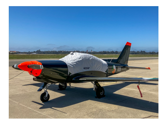
Siai Marchetti SF260 Canopy Cover

This cover type is made from Silver Acrylic Sunbrella canvas and is 100% lined with a soft and smooth microfiber. Bruce's Custom Covers developed this material combination especially for aircraft protection. The outer material is medium weight and treated for water resistance, UV resistance and anti-static buildup. The inner lining is a very soft and smooth microfiber to prevent scratching. The material is very reflective, and tests show that the cabin interior temperature can be reduced to near-ambient temperature on the hottest of days. It is water, ice and snow repellent, yet breathable to allow moisture to escape from between the cover and the aircraft surface.