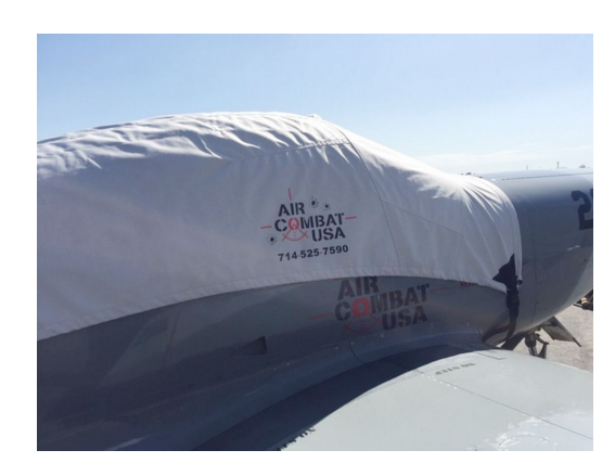
1974 Siai-Marchetti SF 260B Canopy Cover with customized Imprint