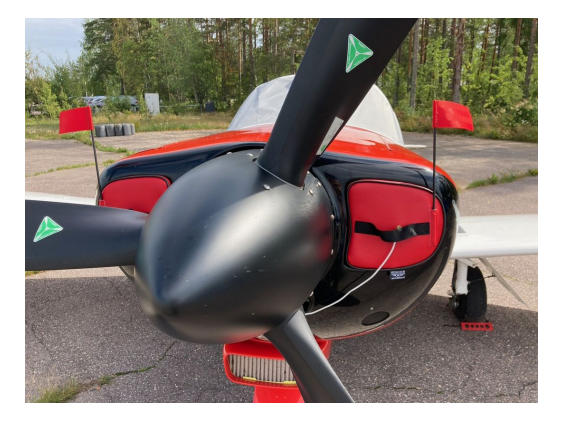
Siai Marchetti SF260 Engine Plugs