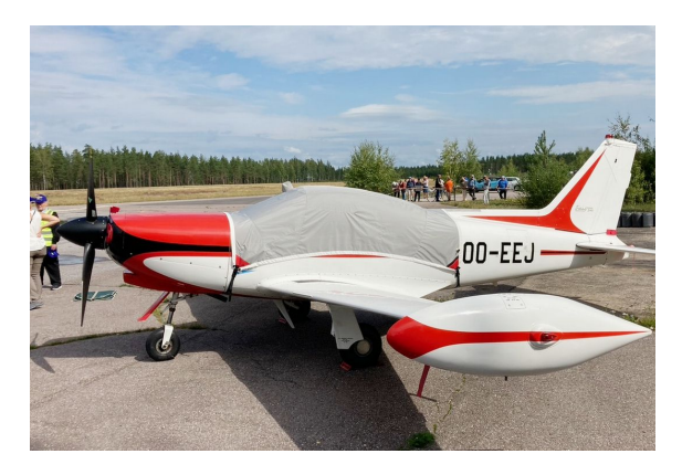
Siai Marchetti SF260 Light Weight Travel Canopy Cover