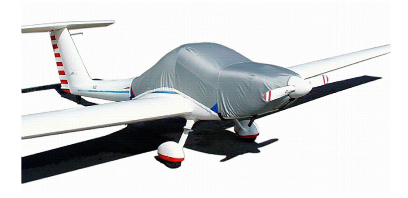
Grob 109 Canopy/Engine Cover

This cover type is made from Silver Acrylic Sunbrella canvas and is 100% lined with a soft and smooth microfiber. Bruce's Custom Covers developed this material combination especially for aircraft protection. The outer material is medium weight and treated for water resistance, UV resistance and anti-static buildup. The inner lining is a very soft and smooth microfiber to prevent scratching. The material is very reflective, and tests show that the cabin interior temperature can be reduced to near-ambient temperature on the hottest of days. It is water, ice and snow repellent, yet breathable to allow moisture to escape from between the cover and the aircraft surface.