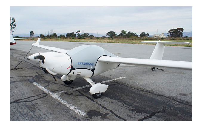
Lambada Canopy Cover