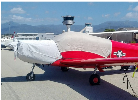
Siai Marchetti S.205/208 Canopy, Engine & Prop Covers

The Siai Marchetti S.205/S.208 Canopy/Engine Cover is a one-piece cover (100% lined with microfiber) that is a combination of the Canopy Cover and Engine Cover. This cover will enclose the engine cowl and will extend aft to cover all of the windows. This cover type is made from Silver Acrylic Sunbrella canvas and is 100% lined with a soft and smooth microfiber. Bruce's Custom Covers developed this material combination especially for aircraft protection. The outer material is medium weight and treated for water resistance, UV resistance and anti-static buildup. The inner lining is a very soft and smooth microfiber to prevent scratching. The material is very reflective, and tests show that the cabin interior temperature can be reduced to near-ambient temperature on the hottest of days. It is water, ice and snow repellent, yet breathable to allow moisture to escape from between the cover and the aircraft surface.