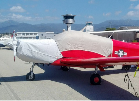
Siai Marchetti S.205/208 Canopy, Engine & Prop Covers

The Siai Marchetti S.205/S.208 Canopy/Engine Cover is a one-piece cover (100% lined with microfiber) that is a combination of the Canopy Cover and Engine Cover. This cover will enclose the engine cowl and will extend aft to cover all of the windows. This cover type is made from Silver Acrylic Sunbrella canvas and is 100% lined with a soft and smooth microfiber. Bruce's Custom Covers developed this material combination especially for aircraft protection. The outer material is medium weight and treated for water resistance, UV resistance and anti-static buildup. The inner lining is a very soft and smooth microfiber to prevent scratching. The material is very reflective, and tests show that the cabin interior temperature can be reduced to near-ambient temperature on the hottest of days. It is water, ice and snow repellent, yet breathable to allow moisture to escape from between the cover and the aircraft surface.