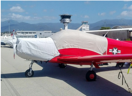
Siai Marchetti S.205/208 Canopy, Engine & Prop Covers

This cover type is made from Silver Acrylic Sunbrella canvas and is 100% lined with a soft and smooth microfiber. Bruce's Custom Covers developed this material combination especially for aircraft protection. The outer material is medium weight and treated for water resistance, UV resistance and anti-static buildup. The inner lining is a very soft and smooth microfiber to prevent scratching. The material is very reflective, and tests show that the cabin interior temperature can be reduced to near-ambient temperature on the hottest of days. It is water, ice and snow repellent, yet breathable to allow moisture to escape from between the cover and the aircraft surface.