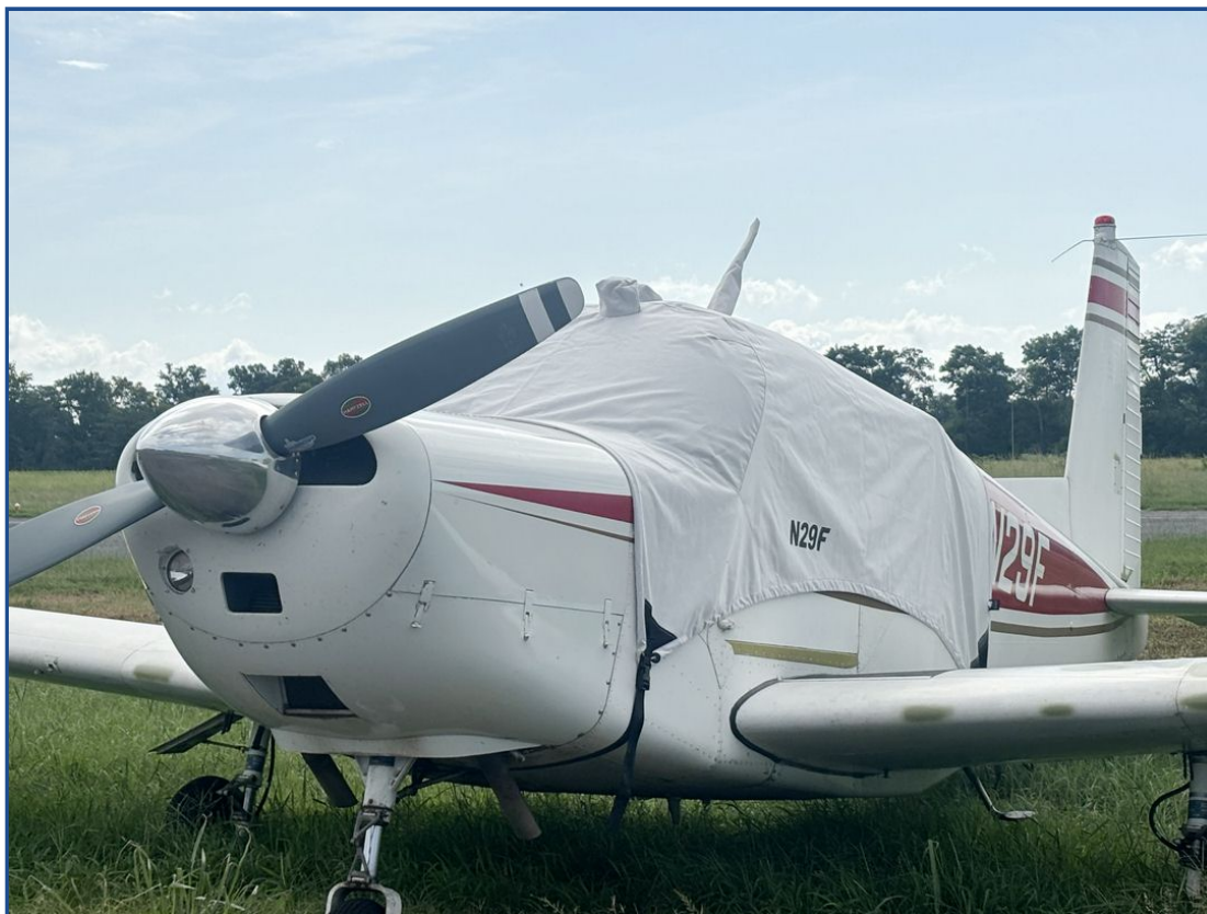
Siai-Marchetti S.205 Canopy Cover