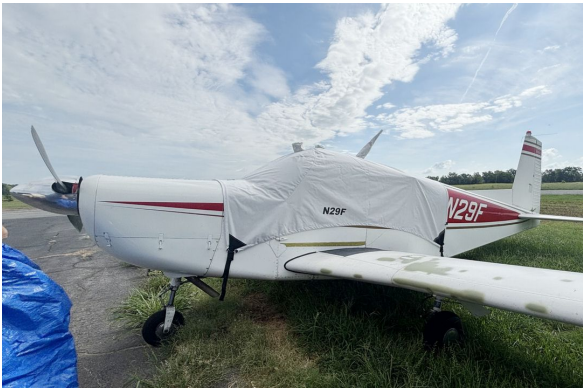
Siai-Marchetti S.205 Canopy Cover