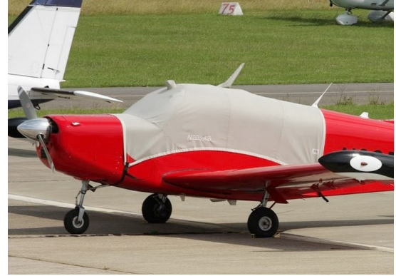
Siai Marchetti S.205/208 Canopy Cover