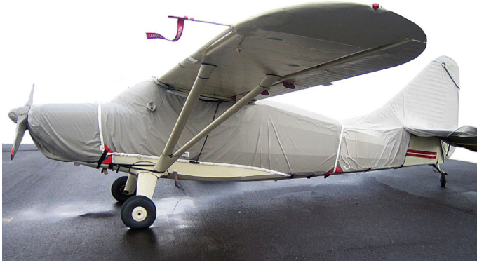
Stinson 108 Canopy, Engine, Prop & Empennage Covers

The material is very reflective, and tests show that the cabin interior temperature can be reduced to near-ambient temperature on the hottest of days. It is water, ice and snow repellent, yet breathable to allow moisture to escape from between the cover and the aircraft surface.