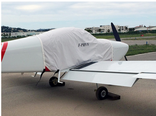
Van's Aircraft RV-9/9A Extended Canopy Cover

This cover type is made from Silver Acrylic Sunbrella canvas and is 100% lined with a soft and smooth microfiber. Bruce's Custom Covers developed this material combination especially for aircraft protection. The outer material is medium weight and treated for water resistance, UV resistance and anti-static buildup. The inner lining is a very soft and smooth microfiber to prevent scratching. The material is very reflective, and tests show that the cabin interior temperature can be reduced to near-ambient temperature on the hottest of days. It is water, ice and snow repellent, yet breathable to allow moisture to escape from between the cover and the aircraft surface.