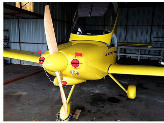
Van's RV-9A Engine Inlet Plugs