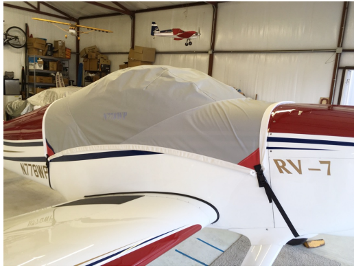
Van's RV-7 Travel Canopy Cover

occasional use outside. We also have an ultra lightweight material available for fitted hangar dust covers. For daily outdoor use, the non-travel Sunbrella Cover is the best choice.