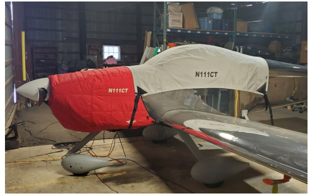
Van's RV-9 Insulated Engine Cover