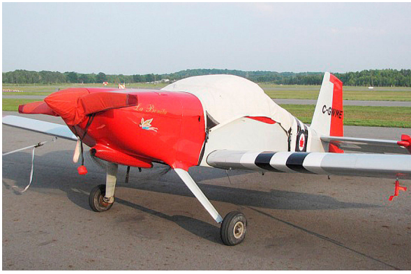
Van's RV-6 2-Blade Prop Cover