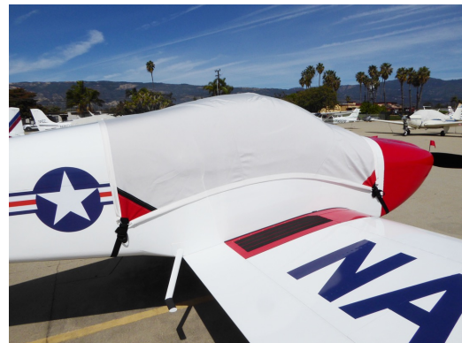
Van's RV-6 Canopy Cover