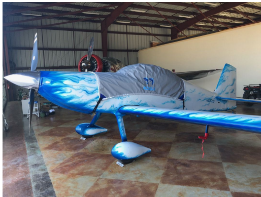
Van's RV-8 Fastback Travel Canopy Cover

Travel Covers are made with Silver Solution-Dyed Polyester fabric and only lined over the windshield to save weight. The material is lightweight and more compact for easy stowage in the aircraft. The polyester material is water resistant, but only intended for occasional use outside. We also have an ultra lightweight material available for fitted hangar dust covers. For daily outdoor use, the non-travel Sunbrella Cover is the best choice.