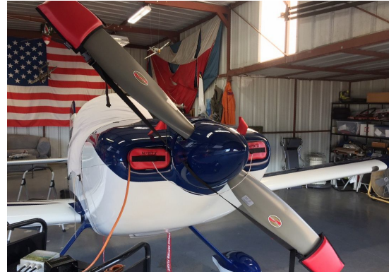
Van's RV-8 Engine Plugs, Prop Tip Protectors