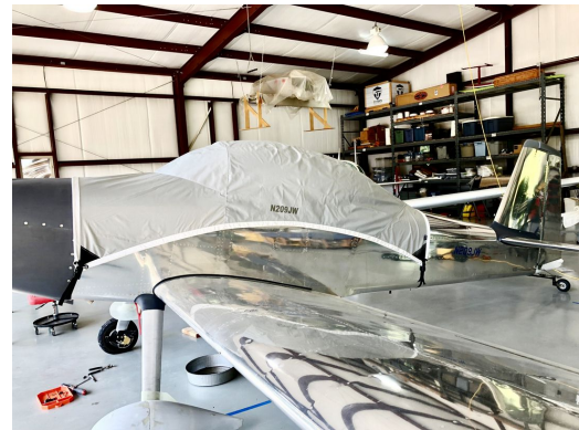
Van's RV-8 Light Weight Travel Canopy Cover