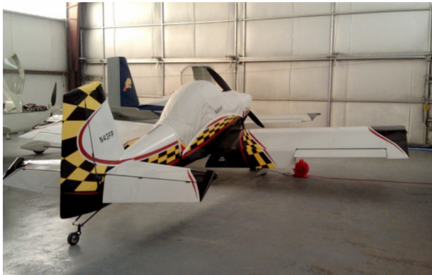
Van's Aircraft RV-8/8A Canopy Cover, Belly Strap Type (Extends To Cover Baggage Door)

This cover type is made from Silver Acrylic Sunbrella canvas and is 100% lined with a soft and smooth microfiber. Bruce's Custom Covers developed this material combination especially for aircraft protection. The outer material is medium weight and treated for water resistance, UV resistance and anti-static buildup. The inner lining is a very soft and smooth microfiber to prevent scratching. The material is very reflective, and tests show that the cabin interior temperature can be reduced to near-ambient temperature on the hottest of days. It is water, ice and snow repellent, yet breathable to allow moisture to escape from between the cover and the aircraft surface.