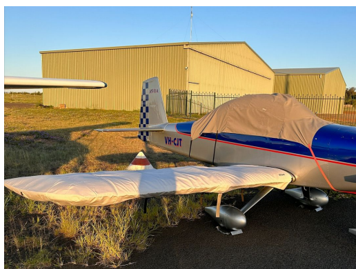
Van's Aircraft RV-8/8A Wing Covers, All Year Use

WINTER USE MATERIAL - Made with Solution-Dyed Polyester fabric, this option is intended for seasonal use to aid in deicing, rain mitigation, or for occasional travel. The material is lighter and more compact, but more susceptible to UV damage and may have a shorter useful life if used continuously outside than the all-year use material.