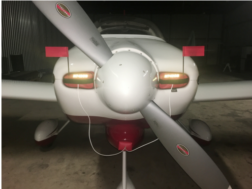
Van's Aircraft RV-7A Engine Inlet Plugs

Engine Inlet Plugs are custom fit for your Van's Aircraft RV-8/8A intakes, made with heavy-duty vinyl material, and stuffed with a single block of sculpted urethane foam. Each plug has a zipper that allows the foam to be removed and dried if necessary. Engine plugs have warning flags that are visible from the cockpit or 'remove before flight' streamers sewn onto the face of the plugs. Most plugs are imprinted with the aircraft registration number in black for an extra charge. Storage bag NOT included. Engine plugs may be inserted after flight when the engine is still warm. Engine Inlet Plugs are commonly referred to as Cowl Plugs, Intake Plugs, Cowl Blocks, Engine Blocks, and Engine Bungs.