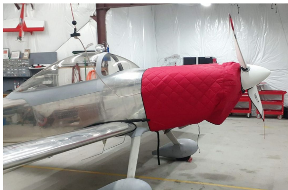
Van's Aircraft RV-8/8A Insulated Hangar Blanket, Interior Use

This cover type is made from Silver Acrylic Sunbrella canvas and is 100% lined with a soft and smooth microfiber. Bruce's Custom Covers developed this material combination especially for aircraft protection. The outer material is medium weight and treated for water resistance, UV resistance and anti-static buildup. The inner lining is a very soft and smooth microfiber to prevent scratching. The material is very reflective, and tests show that the cabin interior temperature can be reduced to near-ambient temperature on the hottest of days. It is water, ice and snow repellent, yet breathable to allow moisture to escape from between the cover and the aircraft surface.