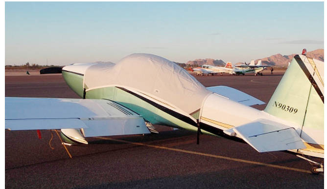
Van's RV-8 Canopy Cover