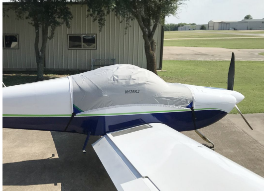
Van's RV-9A Travel Weight Canopy Cover

Travel Covers are made with Silver Solution-Dyed Polyester fabric and only lined over the windshield to save weight. The material is lightweight and more compact for easy stowage in the aircraft. The polyester material is water resistant, but only intended for occasional use outside. We also have an ultra lightweight material available for fitted hangar dust covers. For daily outdoor use, the non-travel Sunbrella Cover is the best choice.