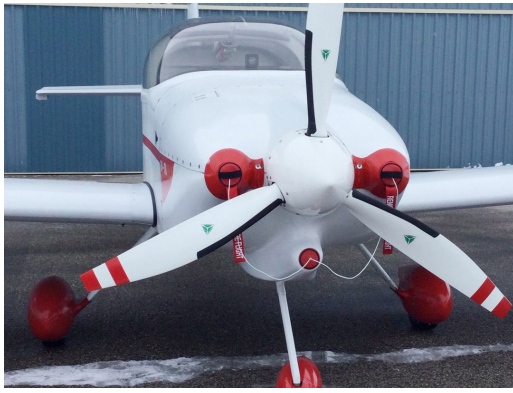
Van's RV-7 Engine Inlet Plugs, Sam James Cowling (Set of 3)