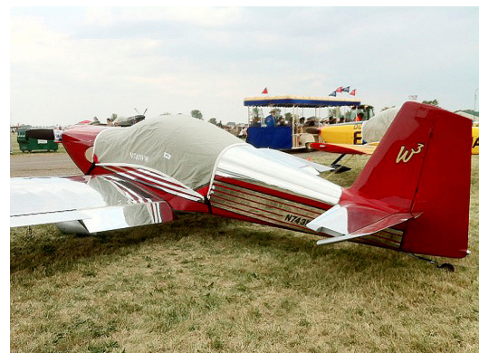
Van's RV-7 Canopy Cover