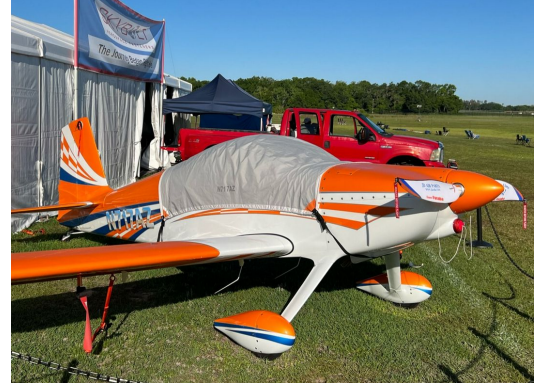
Van's RV-7 Travel Weight Canopy Cover