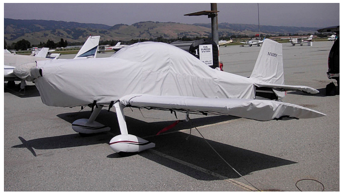
Van's RV-8 Complete Fuselage Cover w/ Detachable Wing Covers & Prop Cover