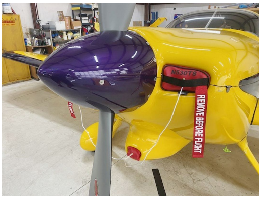
Van's Aircraft RV-7 Engine Inlet Plugs