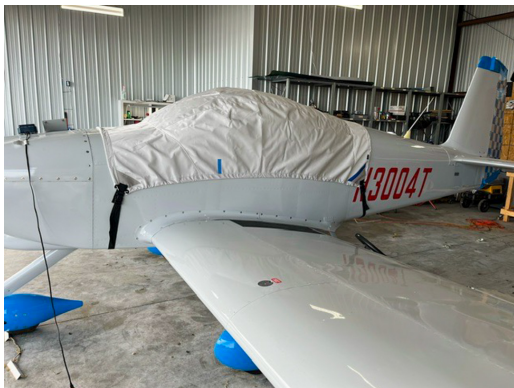
Van's RV-7 Canopy Cover

This cover type is made from Silver Acrylic Sunbrella canvas and is 100% lined with a soft and smooth microfiber. Bruce's Custom Covers developed this material combination especially for aircraft protection. The outer material is medium weight and treated for water resistance, UV resistance and anti-static buildup. The inner lining is a very soft and smooth microfiber to prevent scratching. The material is very reflective, and tests show that the cabin interior temperature can be reduced to near-ambient temperature on the hottest of days. It is water, ice and snow repellent, yet breathable to allow moisture to escape from between the cover and the aircraft surface.