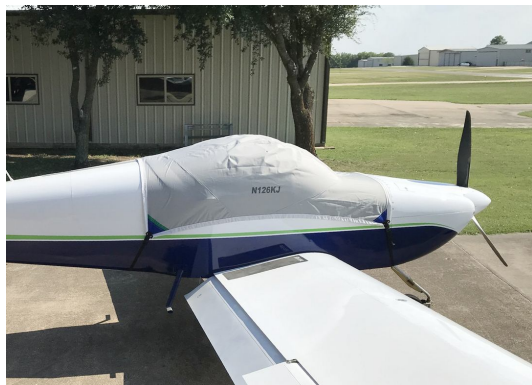
Van's RV-9A Travel Weight Canopy Cover

Travel Covers are made with Silver Solution-Dyed Polyester fabric and only lined over the windshield to save weight. The material is lightweight and more compact for easy stowage in the aircraft. The polyester material is water resistant, but only intended for occasional use outside. We also have an ultra lightweight material available for fitted hangar dust covers. For daily outdoor use, the non-travel Sunbrella Cover is the best choice.