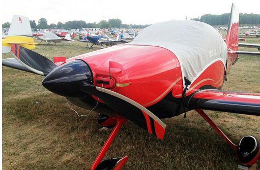
Van's RV-7 Canopy Cover & Engine Inlet Plugs

This cover type is made from Silver Acrylic Sunbrella canvas and is 100% lined with a soft and smooth microfiber. Bruce's Custom Covers developed this material combination especially for aircraft protection. The outer material is medium weight and treated for water resistance, UV resistance and anti-static buildup. The inner lining is a very soft and smooth microfiber to prevent scratching. The material is very reflective, and tests show that the cabin interior temperature can be reduced to near-ambient temperature on the hottest of days. It is water, ice and snow repellent, yet breathable to allow moisture to escape from between the cover and the aircraft surface.