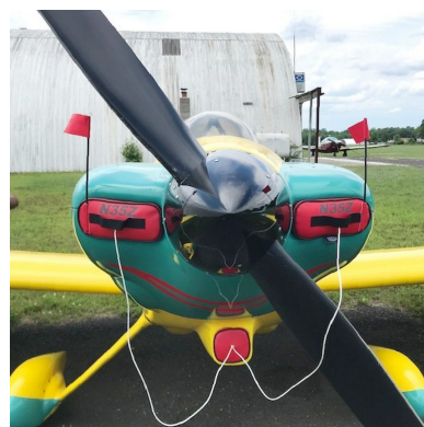
Van's Aircraft RV-4 Engine Inlet Plugs