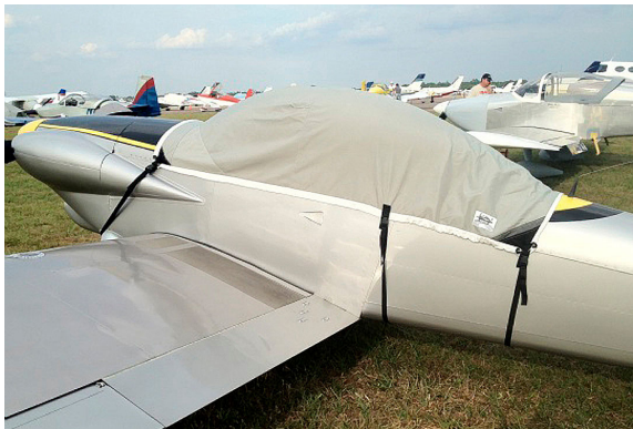
Van's RV-4 Canopy Cover

This cover type is made from Silver Acrylic Sunbrella canvas and is 100% lined with a soft and smooth microfiber. Bruce's Custom Covers developed this material combination especially for aircraft protection. The outer material is medium weight and treated for water resistance, UV resistance and anti-static buildup. The inner lining is a very soft and smooth microfiber to prevent scratching. The material is very reflective, and tests show that the cabin interior temperature can be reduced to near-ambient temperature on the hottest of days. It is water, ice and snow repellent, yet breathable to allow moisture to escape from between the cover and the aircraft surface.