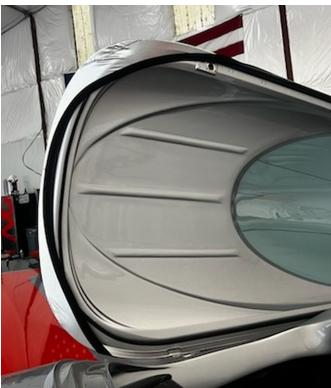
Extra NG Models Canopy Cover (SOLAR CAP EXAMPLE)