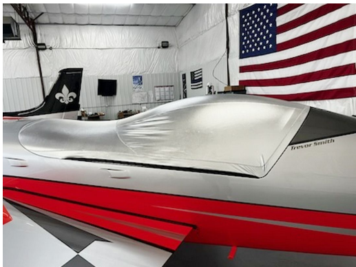
Extra NG Models Canopy Cover (SOLAR CAP EXAMPLE)

Travel Covers are made with Silver Solution-Dyed Polyester fabric and only lined over the windshield to save weight. The material is lightweight and more compact for easy stowage in the aircraft. The polyester material is water resistant, but only intended for occasional use outside. We also have an ultra lightweight material available for fitted hangar dust covers. For daily outdoor use, the non-travel Sunbrella Cover is the best choice.