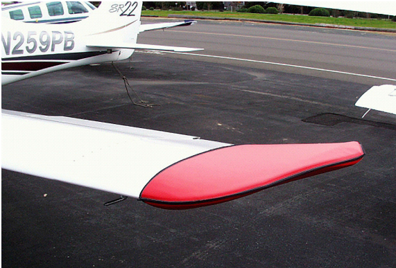
Cirrus SR-22 Wingtip Pad (also available for the Horiz. Stab.