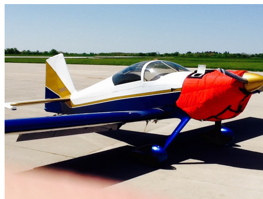
Van's RV-7 Insulated Engine Cover