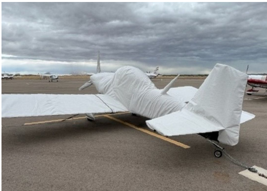
Vans RV-8 Complete Cover Set