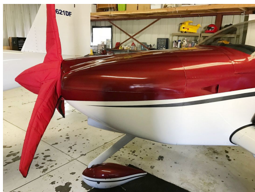
Van's RV-9 Insulated Prop Cover, 3-blade

This cover type is made from Silver Acrylic Sunbrella canvas and is 100% lined with a soft and smooth microfiber. Bruce's Custom Covers developed this material combination especially for aircraft protection. The outer material is medium weight and treated for water resistance, UV resistance and anti-static buildup. The inner lining is a very soft and smooth microfiber to prevent scratching. The material is very reflective, and tests show that the cabin interior temperature can be reduced to near-ambient temperature on the hottest of days. It is water, ice and snow repellent, yet breathable to allow moisture to escape from between the cover and the aircraft surface.